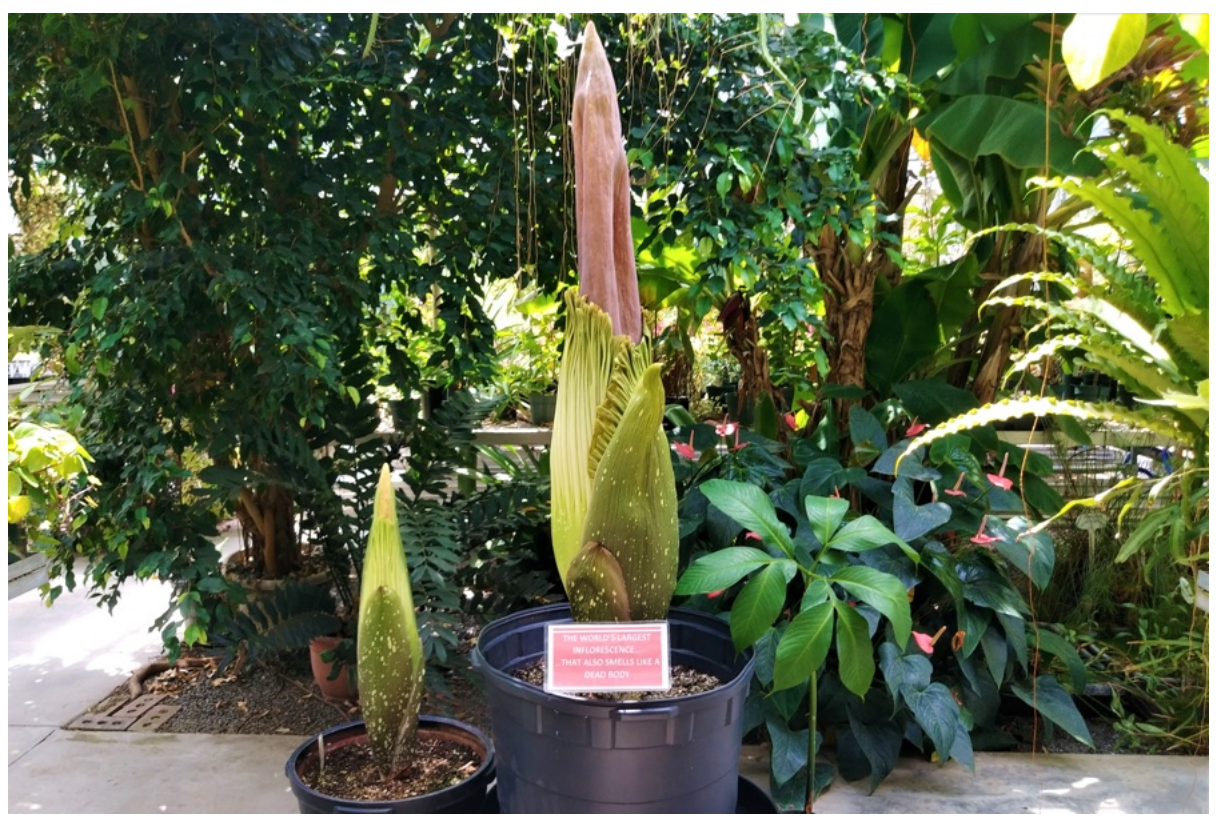
These two rare corpse flowers are getting ready to bloom.

Anyone who missed the chance to see — and smell — Longwood Gardens' corpse flower last summer will get another shot in the next week to experience this rare event locally.