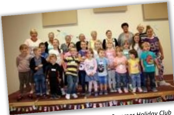
Summer Holiday Club