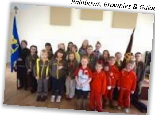
Rainbows, Brownies & Guides

A very successful Holiday Club is held annually during the school summer holidays and is attended by around 25 children each day.