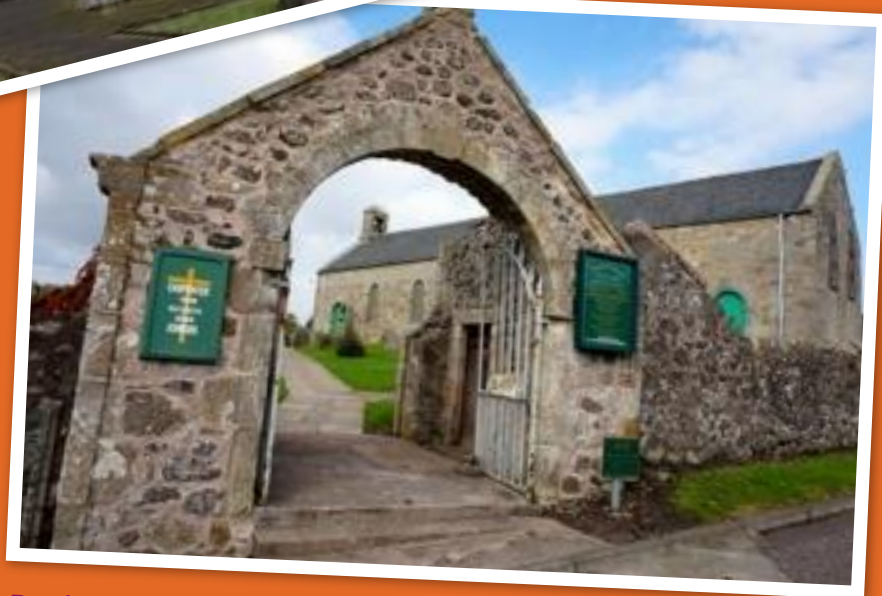
Building at Kinglassie