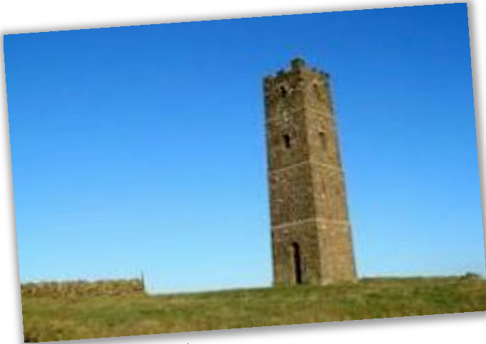
Blyth's Tower, Kinglassie