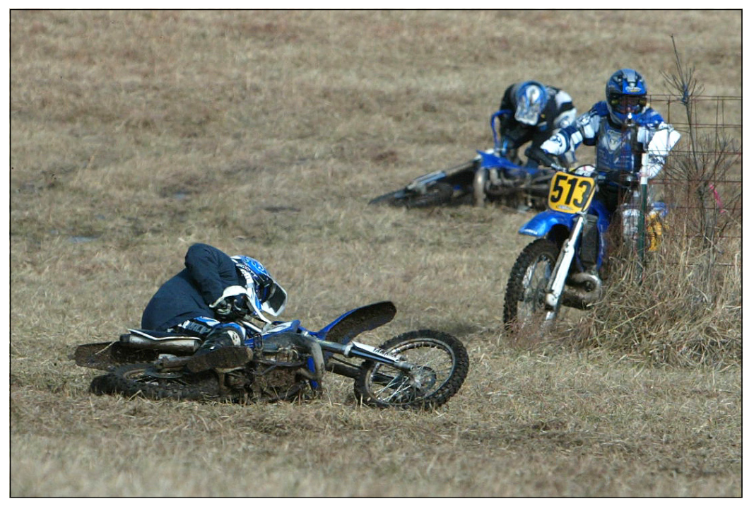
The track got slick at Warsaw