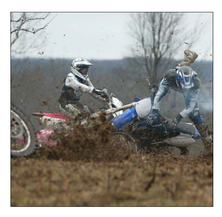
Oops, here's a crash at the start of the C Class