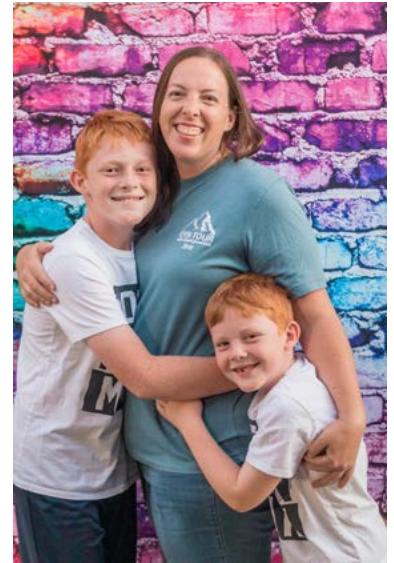
Photos from the Mother/Son event.