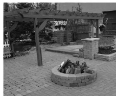
Decorative Brick Patios & Fire Pits