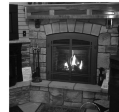
Fireplace Shop: Wood & Gas

GAS - WOOD FIREPLACES AND INSERTS REGENCY