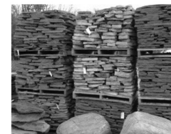
Natural Stone Yard