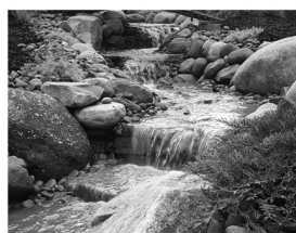
Pond & Fountain Shop