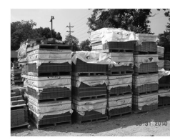
Brick & Retaining Wall Yard