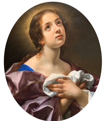
Feast Day: February 5