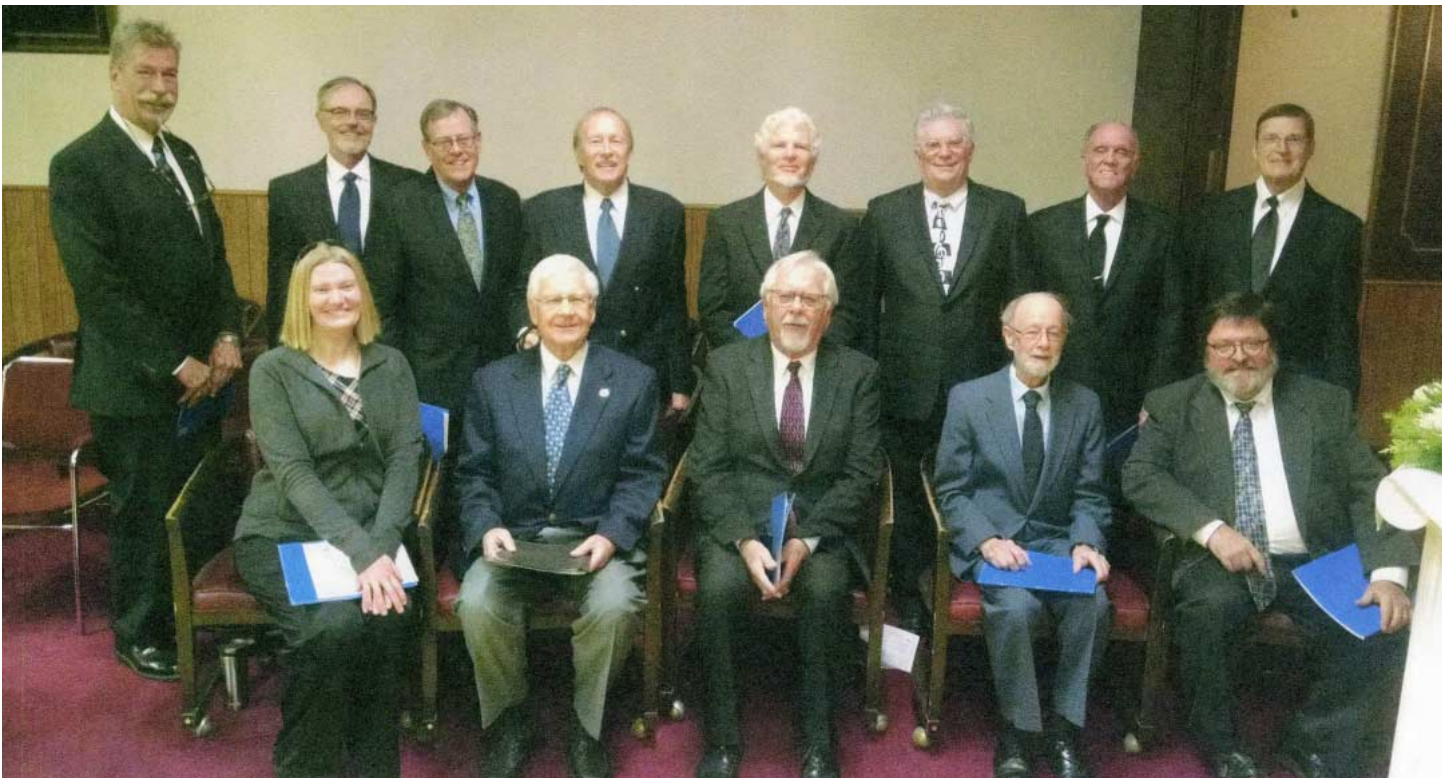
Denver Mountainaires – Memorial Service December 2, 2018