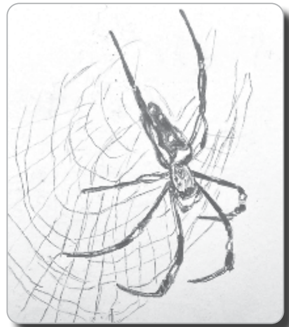
Golden silk orb-weaver

My glorious, colorful front yard had departed from its recent scarlet and yellow fall splendor to the approaching winter's sea of brown. All was still and quiet except Chipper (our friendly house chipmunk), busily collecting his store of winter nuts and seeds that would sustain him underground during his hibernation months. As I wistfully glanced out the front windows at the cold, looming gray clouds, I already longed for the tiny jonquils and bright crocus a few months away.