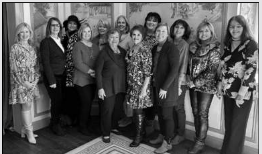
Thirteen ladies from the Mountain Mums Garden Club attended the Annual Leading Lights Luncheon and Fashion Show at Callanwolde. The DeKalb Federation of Garden Clubs hosts the annual event as a fundraiser to support local causes and scholarships.