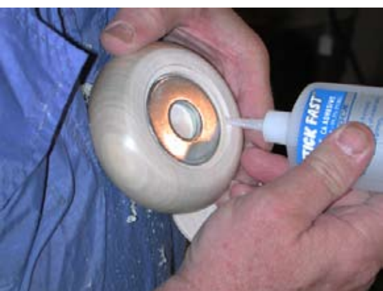
Use drops of cyanoacrylate (CA) glue to secure three washers in the recess.