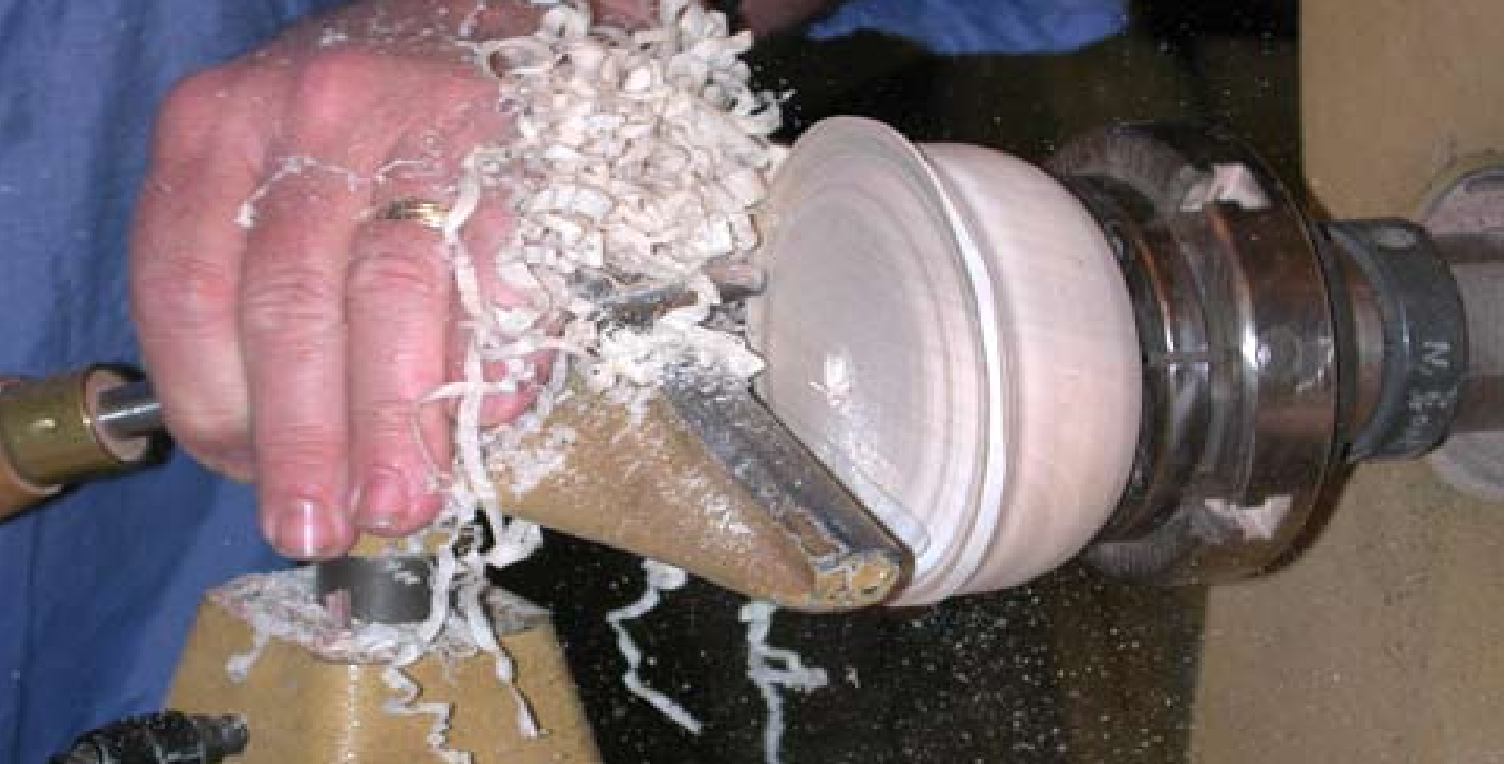
After securing the base to the scroll chuck, true up the paperweight top with a bowl gouge.

scraper. Be sure to carefully measure both the diameter and the depth.