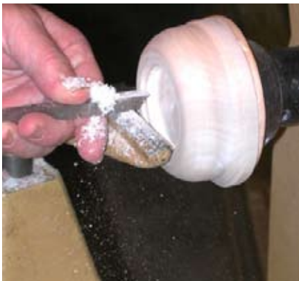
A square-end scraper provides an alternate way to cut a 2⅛" recess.