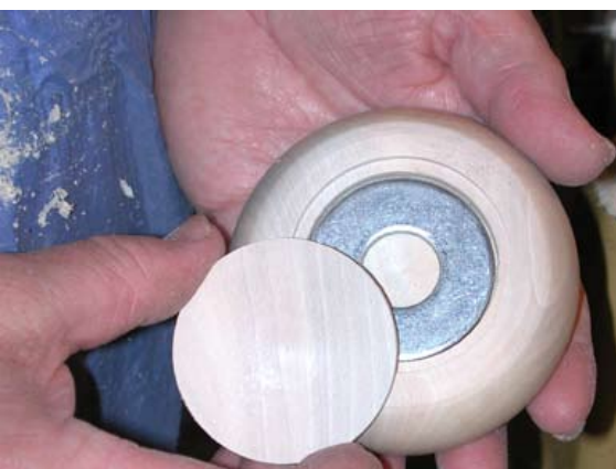
After adhering the washers, cover the base with the plywood cover.