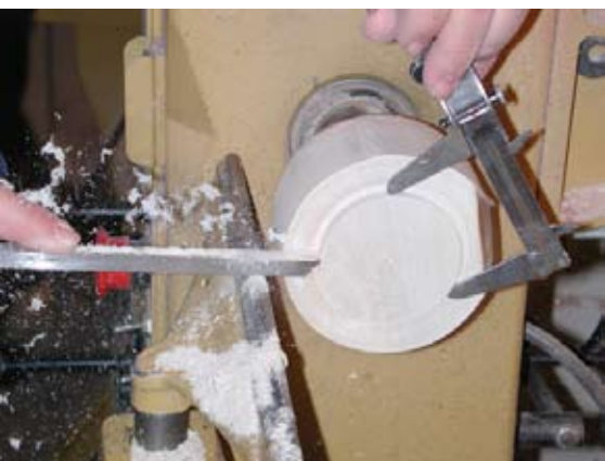
With a vernier scale, check the 2 1/8" diameter of the 1/8"-thick plywood cover.