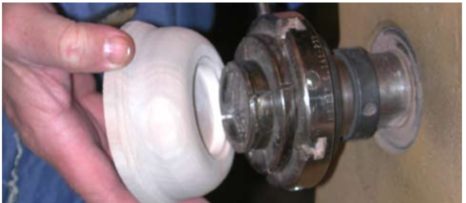
After shaping the bottom of the paperweight, mount the stock to an expanding chuck.