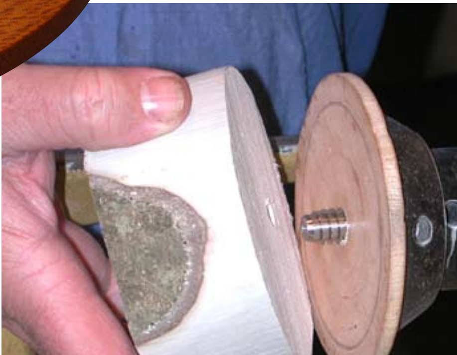
Attach your 2"-thick turning block to a screw chuck. With a ¼" plywood spacer on the screw chuck, the threads will grab about ½" of stock.

If you do not wish to purchase the drill bit, turn a recess with a ⅜" bedan tool or square-end