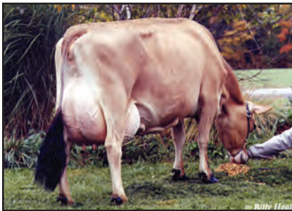
DEN-KEL LEMVIG JELLY-ET Great-Grandam of Lot 881