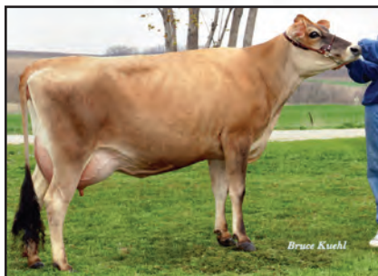
HEARTLAND KLASSIC ARIZONA Great-Grandam of Lot 2534

ST SR DF RA RW RL FA 0.1 0.7 0.6 H0.1 0.6 S0.3 S0.7 FU RH RUW UC UD TP TL -0.3 0.1 0.1 0.7 D0.7 C0.1 L0.2