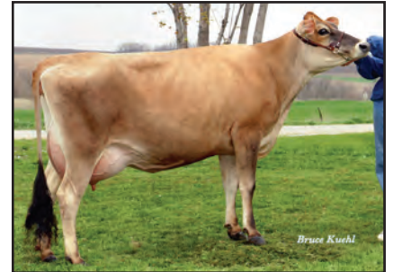
HEARTLAND KLASSIC ARIZONA Great-Grandam of Lot 2696