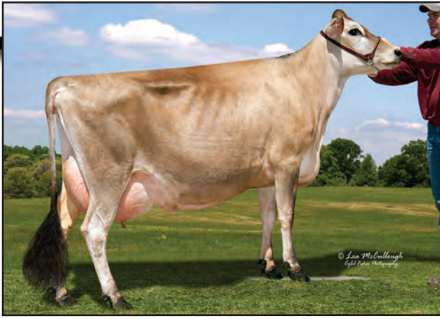
TENN LOUIE 260 HEH MAID, VG-85% Dam of Lot 2708