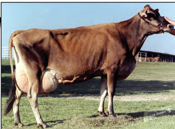
HEARTLAND QUEST BREEZE, VG-87% Fourth Dam of Lot 2875