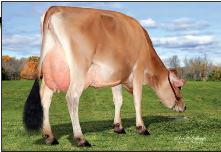
Selling as Lot 2477