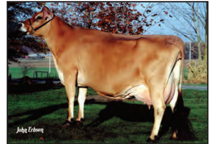
VANTAGE LEMVIG MAMME Great-Grandam of Lot 2723

TOLLENAARS ARTIST LYNDON-ET USA 061929278 GT 50K JH1F JH2F 29JE3508 CDCB GPTA 12/01/2014 1672DAUS 168HRDS 40%RIP 99%R 233M 0.03% 16F 23%ILE 99%R -0.03% 3P 91CM$ 102NM$ 126FM$ 127GM$ 0.5PL 1.2DPR 0.8CCR 1.1HCR 3.13SCS AJCA 12/01/2014 453DAUS GPTAT 97%R 0.6 GJUI 3.2 GJPI 97%R 35