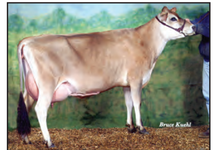
HEARTLAND BERRETTA AUGUST FIVE Sister to the Grandam of Lot 1519

D&E AVERY KODY USA 110663605 GT 50K JH1F JH2F 122JE5166 CDCB GPTA 12/01/2014 3392DAUS 463HRDS 3%RIP 99%R 186M -0.14% -16F 4%ILE 99%R -0.02% 3P -144CM$ -136NM$ -118FM$ -190GM$ -1.7PL -3.0DPR -2.7CCR 0.2HCR 3.11SCS AJCA 12/01/2014 2101DAUS GPTAT 99%R 0.2 GJUI -2.1 GJPI 99%R -56