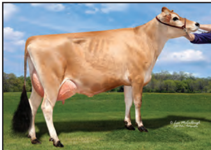
HEARTLAND IMPRESS TAMPA-ET Sister to Lot 2048