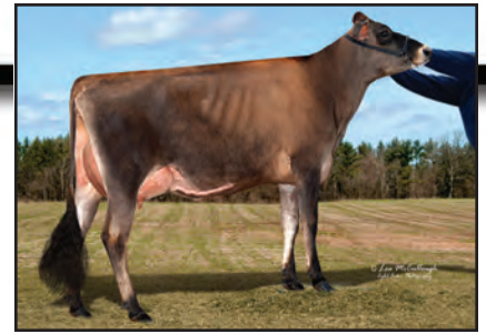
HER-MAN IMPRESSIVE MADRID-ET Sister to Lot 880

SISTER(S): THREE VALLEYS C JACINTO MAID 88% 3-08 305 3 19630 4.7 920 3.6 703 94DCR 2430C