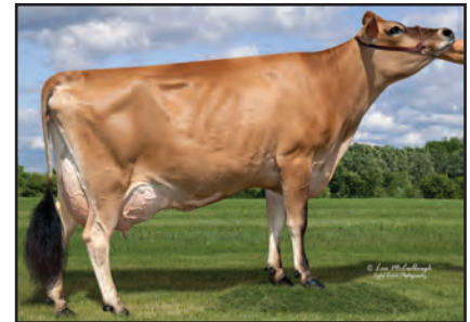
TJF/LEE ACTION MAMME 847-ET Grandam of Lot 2723

SUNSET CANYON MATINEE S BELLE 90% USA 115458011 GT50K JH1F JH2F TATTOO / C553 DHIA HERD # 92-23-0452 CONTROL # 1553 1-09 305 2 18470 4.9 914 3.5 652 92DCR 2254C 2-07 305 2 21380 5.0 1078 3.5 757 97DCR 2617C 4-00 305 2 21350 5.0 1069 3.5 743 97DCR 2568C 305 2X ME AVG 3L 23748M 1180F 838P 2896C PPA 1165M 116F 24P / YD 396M 71F -3P CDCB GPTA 03/03/2015 3RECS 85%R 68%ILE 89M 26F -6P 84CM$ 98NM$ 132FM$ 96GM$ 1.0PL 0.3DPR 1.0CCR 1.1HCR 2.99SCS AJCA 03/03/2015 GPTAT 80%R 0.6 GJUI 1.8 GJPI 80%R 18