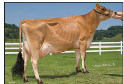
TJF/LEE LEXNTN MAMME 792 Sister to the Grandam of Lot 2723

TJF/LEE ACTION MAMME 847-ET 91% USA 116435697 GT JH1F TATTOO / T847 DHIA HERD # 48-89-0168 CONTROL # 5558 2-01 305 3 18120 5.4 976 3.6 659 93DCR 2279C 3-01 305 3 19550 5.4 1053 3.7 721 94DCR 2494C 4-04 305 3 18530 6.0 1110 3.7 685 95DCR 2369C 5-06 255 3 15928 7.0 1112 3.7 586 RIP 17225 1280 684 PME 305 2X ME AVG 3L 18360M 1041F 690P 2386C PPA -207M 89F -6P / YD -338M 53F -7P CDCB GPTA 03/03/2015 4RECS 71%R 89%ILE -371M 23F -8P 202CM$ 194NM$ 176FM$ 222GM$ 3.0PL 2.0DPR 2.3CCR 2.7HCR 2.92SCS AJCA 03/03/2015 GPTAT 65%R 1.1 GJUI 17.0 SELLING AS LOT 5558 GJPI 65%R 65 SIRE: FOREST GLEN AVERY ACTION-ET JPI 12 16%ILE