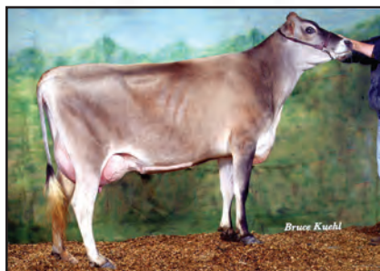
HEARTLAND HALLMARK ALTHEA Sister to the Grandam of Lot 1828