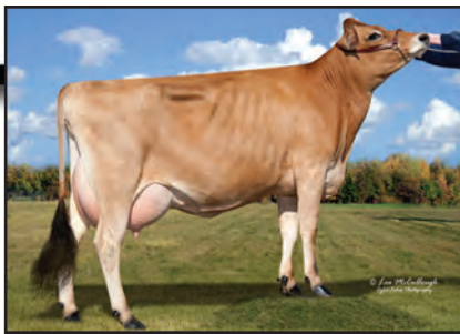
RIVER VALLEY CARRIER SALINA I-ET Selling as Lot 2056