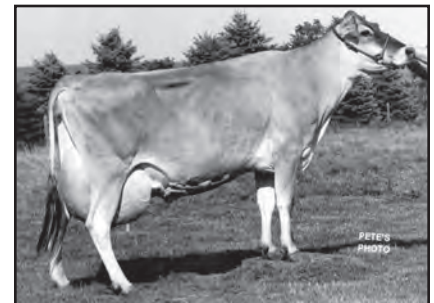
SUMMETZ SOONER BETTY Fifth Dam of Lot 2851