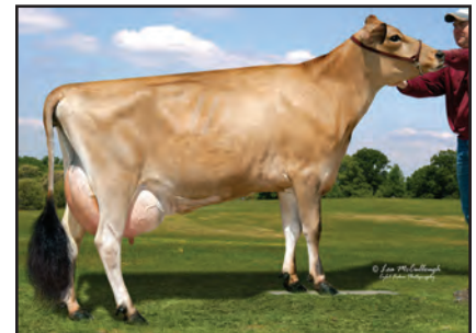
HEARTLAND IATOLA SPACE-ET Sister to the Grandam of Lot 2265