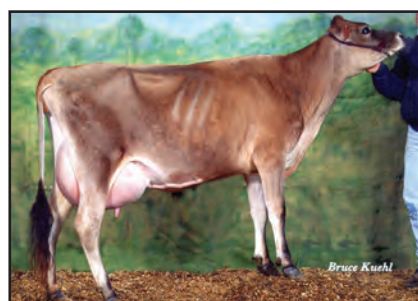
HEARTLAND PARAMOUNT BRYN-ET Grandam of Lot 2628