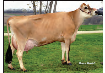
HEARTLAND MANNIX KYLIE-ET Grandam of Lot 2466