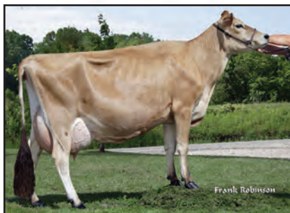
SUNBOW JACE LADY-ET Grandam of Lot 2791

GABYS BLAIR ARUBA-ET 87% USA 115335695 GT50K JH1F JH2F TATTOO G1367 / G1367 DHIA HERD # 51-17-0421 CONTROL # 1367 2-01 305 2 18870 4.7 884 3.6 688 100DCR 2368C 305 2X ME AVG 2L 19892M 974F 722P 2474C PPA 1654M 84F 78P / YD 1233M 63F 64P CDCB GPTA 03/03/2015 2RECS 85%R 70%ILE 295M 21F 18P 120CM$ 104NM$ 64FM$ 73GM$ -0.6PL -0.8DPR -1.7CCR -2.7HCR 2.97SCS AJCA 03/03/2015 GPTAT 81%R 0.3 GJUI -0.5 GJPI 80%R 44