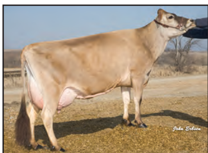
HEARTLAND JENETTA BILL PHOENIX Sister to the Grandam of Lot 2924