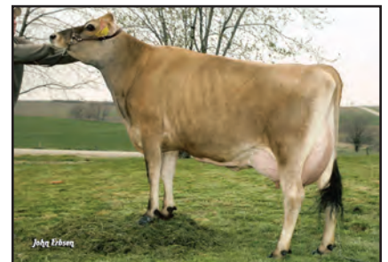
HEARTLAND JOHN SHANNON Sister to the Dam of Lot 2736