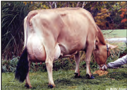
DEN-KEL LEMVIG JELLY-ET Fourth Dam of Lot 2948

HEARTLAND NATHAN TEXAS-ET 95% USA 067041437 GT50K JH1F JH2F DHIA HERD # 48-89-0168 CONTROL # 1437 2-10 305 3 21850 4.6 1008 3.9 843 93DCR 2785C 3-11 305 3 26340 4.3 1130 3.8 991 92DCR 3185C 5-01 305 3 25940 4.6 1185 3.7 963 94DCR 3232C 7-00 183 3 17610 4.8 844 3.5 610 79DCR 2108C 305 2X ME AVG 5L 21944M 1006F 828P 2737C PPA 1815M 28F 72P / YD 1062M 25F 49P CDCB GPTA 03/03/2015 5RECS 86%R 89%ILE 234M 4F 15P 214CM$ 198NM$ 160FM$ 122GM$ 3.4PL -1.8DPR -1.0CCR 0.1HCR 2.91SCS AJCA 03/03/2015 GPTAT 79%R 1.2 GJUI 17.0 GJPI 78%R 70