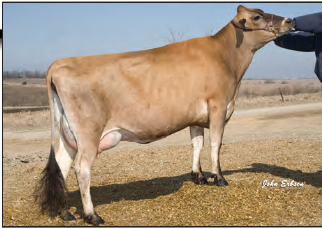
HEARTLAND ACTION CHLOE, VG-85% Dam of Lot 1724