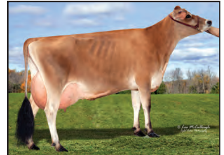
HEARTLAND HEADLINE SUNKIST Sister to Lot 2684