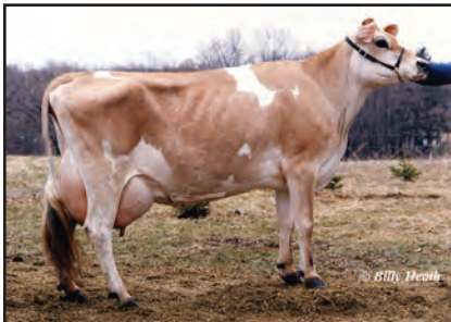
HOLLYROCK MARCUS JULIE Fourth Dam of Lot 881