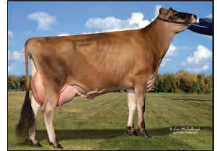
HEARTLAND ACTION KAVA-ET Dam of Lot 2466

4TH DAM: T. BRASS JULIA 88% 3-07 305 2 11870 3.9 463 3.2 374 DHIR 1213C