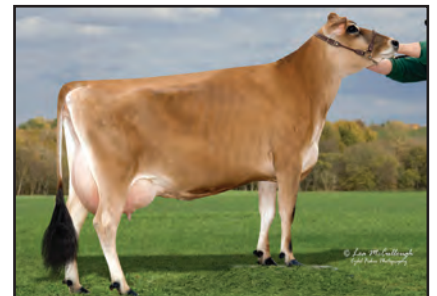
HEARTLAND LETTERMAN SOPHIA Sister to the Dam of Lot 2790