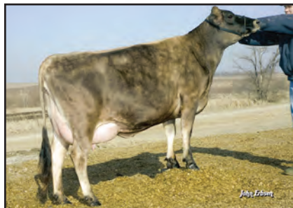
HEARTLAND MANHATTEN BONNIE-ET Sister to the Grandam of Lot 2752