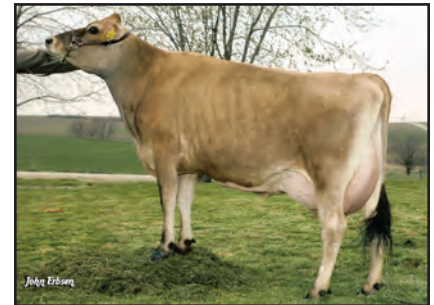
HEARTLAND JOHN SHANNON Sister to the Grandam of Lot 2265