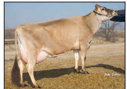
HEARTLAND JENETTA BILL PHOENIX Sister to the Dam of Lot 1717