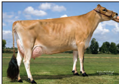
HEARTLAND ABE AVALANCHE Selling as Lot 1725