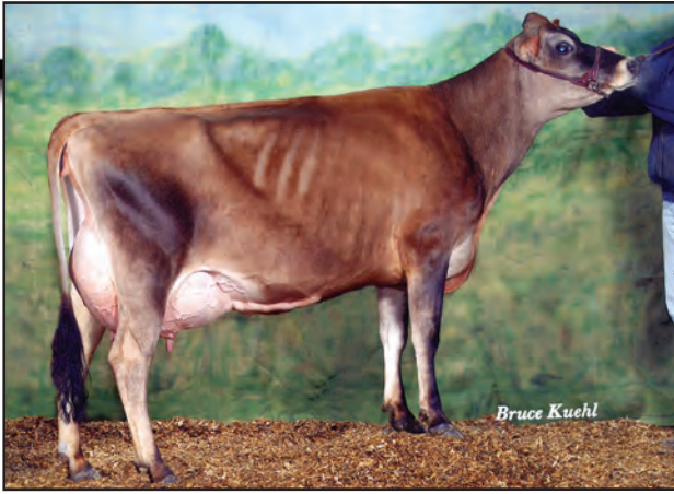
HEARTLAND BARKLY KELLY, E-90% Fourth Dam of Lot 2832