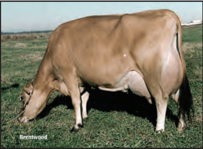
BW BERRETTA PRIZE G525 Great-Grandam of Lot 12336