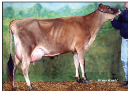
HEARTLAND PARAMOUNT BRYN-ET Great-Grandam of Lot 2752