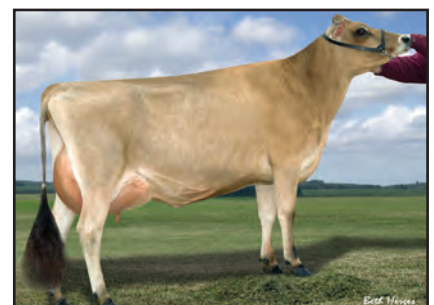
HILL TOP JARRETT MARIAH Sister to the Dam of Lot 2702