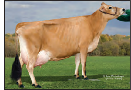
HI-LAND IMPULS FOX Grandam of Lot 2740

HEARTLAND ABE DAKOTA 87% USA 067101573 GT50K JH1F JH2F TATTOO / 1573 DHIA HERD # 48-89-0168 CONTROL # 1573 3-11 305 3 21670 5.6 1224 4.1 880 94DCR 3048C 5-08 305 3 18980 5.7 1084 4.1 769 95DCR 2663C 7-03 305 3 21190 5.5 1159 3.8 804 94DCR 2782C 362 3 24038 5.6 1352 3.9 940 DHIR 3254C 305 2X ME AVG 4L 18488M 1042F 754P 2602C PPA 309M 65F 43P / YD 250M 46F 34P CDCB GPTA 03/03/2015 4RECS 83%R 92%ILE 210M 22F 14P 234CM$ 218NM$ 182FM$ 199GM$ 2.8PL 0.2DPR 1.5CCR 0.4HCR 2.94SCS AJCA 03/03/2015 GPTAT 76%R -0.5 GJUI -5.5 GJPI 77%R 76