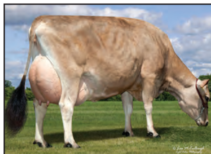
GR WAUNAKEE DALE JOEY 2332-ET Grandam of Lot 2767