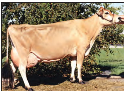
AHLEM BSB PRINCESS 6112 Grandam of Lot 2332