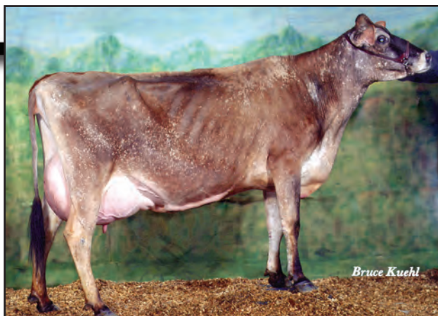
BARBER JANIES JAN, E-91% Great-Grandam of Lot 2676