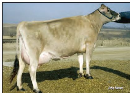
HEARTLAND KLASSIC IVORY Sister to the Dam of Lot 2560

HEARTLAND JERSEYS BREEDER & OWNER SENECA, KS