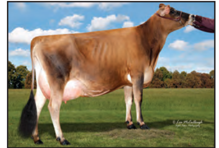
HEARTLAND TOPEKA TRIPOLI-ET Sister to Lot 2708

TENN PROTEIN CFB MAID 83% 4-05 305 2 19900 5.7 1136 3.7 736 95DCR 2546C