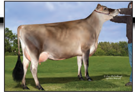
HI-KEL PENNY Grandam of Lot 2922

4TH DAM: DUPAT BILL J832 90% 3-00 305 2 22380 4.7 1042 4.1 910 99DCR 2935C