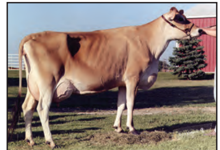
HEARTLAND MONTANA BLEU-ET Sister to the Grandam of Lot 2828

4TH DAM: SUNNY DAY BERRETTA BETH-ET 91% 3-05 305 2 18990 4.0 758 3.9 740 DHIR 2181C