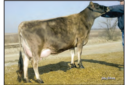
HEARTLAND MANHATTEN BONNIE-ET Sister to the Dam of Lot 2828

DAUGHTER(S): HEARTLAND ULYSSE BROOKE SELLING AS LOT 3155