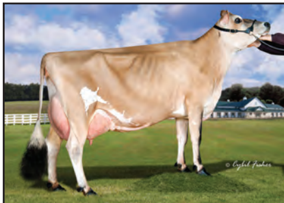
RIVER VALLEY CARRIER SALINA III-ET Sister to Lot 2056