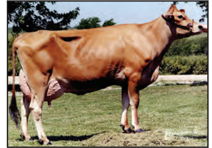
HEARTLAND DECLO DANA Great-Grandam of Lot 2130

RICHIES LEMVIG STAR M1096 86% USA 112417424 TATTOO M1096 / M1096 DHIA HERD # 74-81-0162 CONTROL # 35 1-09 288 3 24150 5.3 1278 3.8 924 88DCR 3197C 2-09 305 3 30450 5.8 1764 4.1 1240 84DCR 4295C 305 2X ME AVG 2L 31016M 1660F 1205P 4170C PPA 3177M 190F 168P / YD 2195M 150F 128P CDCB PTA 12/01/2014 2RECS 72%R 87%ILE 170M 42F 30P 221CM$ 182NM$ 87FM$ 164GM$ -2.1PL -1.6DPR -0.2CCR 0.8HCR 3.13SCS AJCA 12/01/2014 PTAT 62%R 0.5 JUI 4.1 JPI 65%R 80