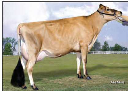
HEARTLAND VALENTINO EVA-ET Daughter of Lot 1573