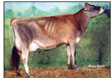
HEARTLAND BARKLY AUGUST TWO Sister to the Grandam of Lot 1519

HEARTLAND BERRETTA A FOUR-ET 82% USA 067011000 GT TATTOO / H1000 DHIA HERD # 48-89-0168 CONTROL # 1000 1-09 297 3 11950 5.1 608 4.0 479 93DCR 1639C 2-08 279 3 12130 5.2 636 4.1 498 91DCR 1710C 3-07 305 3 17920 5.3 954 4.0 710 93DCR 2458C 4-10 300 3 15700 5.2 814 4.1 642 94DCR 2196C 5-10 305 3 21050 4.8 1013 4.2 878 93DCR 2845C 6-10 298 3 16480 5.6 924 4.1 675 90DCR 2338C 305 2X ME AVG 7L 14505M 752F 584P 1982C PPA -3064M -131F -77P / YD -2385M -117F -65P CDCB GPTA 12/01/2014 5RECS 68%R 6%ILE -870M -53F -27P -221CM$ -224NM$ -232FM$ -156GM$ 0.2PL 2.2DPR 2.0CCR -0.7HCR 2.91SCS AJCA 12/01/2014 PTAT 59%R -0.9 GJUI -5.3 GJPI 60%R -86 SIRE: MASON BOOMER SOONER BERRETTA JPI -35 4%ILE