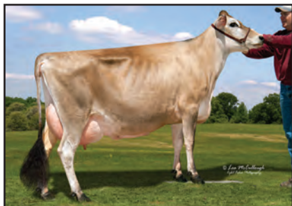
TENN LOUIE 260 HEH MAID Dam of Lot 2724