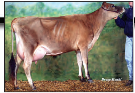
HEARTLAND PARAMOUNT BRYN-ET Grandam of Lot 2828

FRESH: 01/23/2015 BRED: 03/27/2015 DUE: 12/31/2015 TO STEINHAUERS SAMSON LEMONHEAD USA 118662185 14JE670 CDCB GPTA 03/03/2015 67%R 699M 0.09% 51F 98%ILE 68%R 0.05% 36P 527CM$ 499NM$ 430FM$ 483GM$ 4.4PL 1.6DPR 2.2CCR 1.0HCR 2.91SCS AJCA 03/03/2015 ODAUS GPTAT 67%R 2.0 GJUI 23.9 GJPI 64%R 212 52.8 LBS. MILK ON MARCH TEST SCC: 13,000