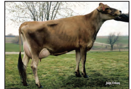
HEARTLAND IMPULS DONNA-ET Sister to the Grandam of Lot 2742