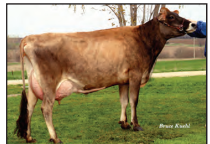
HEARTLAND MANNIX TYME Great-Grandam of Lot 2845