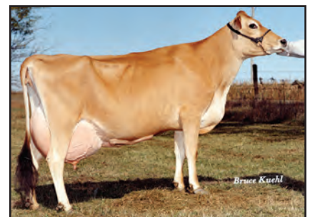
BEACHY BERRETTA SPICE Great-Grandam of Lot 2265