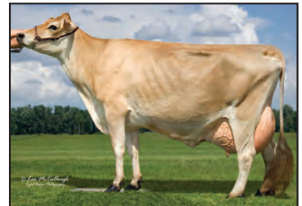
DEN-KEL LOUIE CLARABELLE Grandam of Lot 2915

TOLLENAARS IMPULS LEGAL 233-ET USA 061929249 GT HD JH1C JH2F 29JE3506 CDCB GPTA 12/01/2014 6505DAUS 729HRDS 23%RIP 99%R 525M -0.08% 10F 61%ILE 99%R 0.02% 22P 256CM$ 245NM$ 218FM$ 247GM$ 2.7PL 0.9DPR 2.1CCR 2.6HCR 2.99SCS AJCA 12/01/2014 3333DAUS GPTAT 99%R 1.2 GJUI 21.6 GJPI 99%R 124