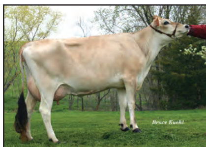
HEARTLAND MANNIX DOVE Great-Grandam of Lot 2594