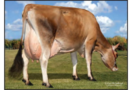
HEARTLAND ABE SUNSHINE Dam of Lot 2684

4TH DAM: HEARTLAND BARBER SHADE 85% 5-01 305 2 24750 4.3 1075 3.3 829 93DCR 2863C