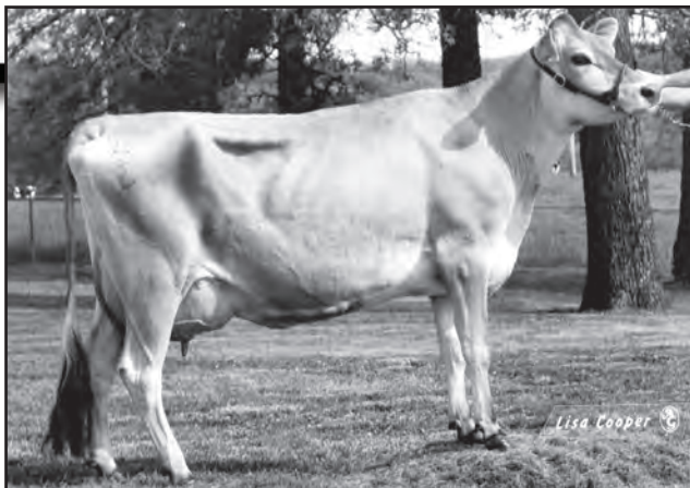
FRERICHS LAWMAN BERRETTA VAL, VG-86% Fourth Dam of Lot 1802