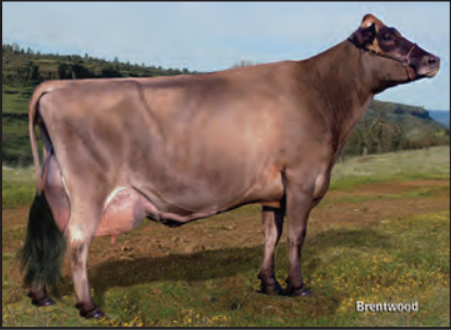
BW AVERY KATIE ET121-ET Grandam of Lot 12336