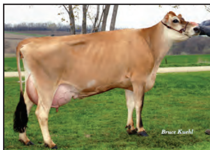
HEARTLAND MANNIX KYLIE-ET Grandam of Lot 2850