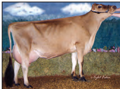
BW PARADE TERRI D492 Great-Grandam of Lot 2831

SUNSET CANYON MERCHANT-ET USA 114256027 GT50K JH1C JH2F 11JE884 CDCB GPTA 12/01/2014 1894DAUS 206HRDS 8%RIP 99%R 89M 0.15% 30F 20%ILE 99%R 0.04% 10P 81CM$ 69NM$ 42FM$ -52GM$ -0.9PL -4.7DPR -5.3CCR -2.5HCR 3.04SCS AJCA 12/01/2014 1304DAUS GPTAT 99%R 1.6 GJUI 18.0 GJPI 98%R 0