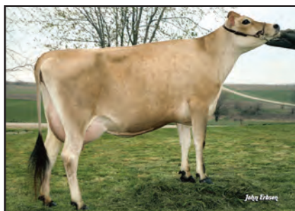
HEARTLAND IMPULS DAWSON Sister to the Grandam of Lot 1984