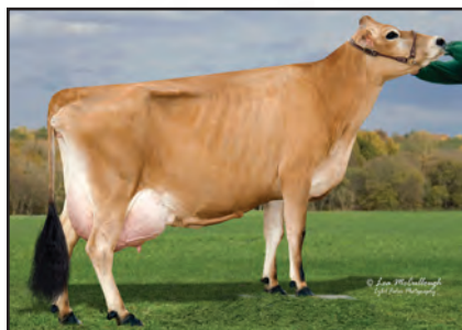
HI-LAND IMPULS FOX Dam of Lot 2848