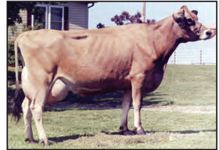
HEARTLAND TOPSIDE NEON Great-Grandam of Lot 2647