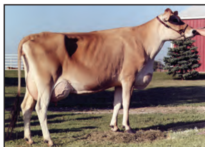
HEARTLAND MONTANA BLEU-ET Sister to the Grandam of Lot 2628