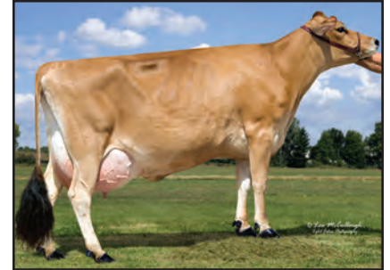
HEARTLAND ABE DALE-ET Sister to Lot 1954

4TH DAM: SCHOOLLEY LESTER DOTTIE 90% 4-10 305 2 17980 4.1 744 3.5 624 DHIA 2001C