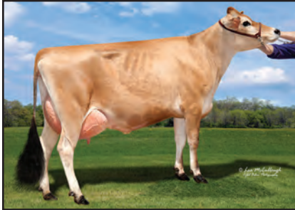
HEARTLAND IMPRESS TAMPA-ET Sister to the Dam of Lot 2664