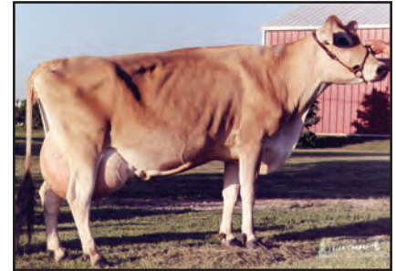
HEARTLAND BOLD LUELLEA Sister to the Grandam of Lot 2533