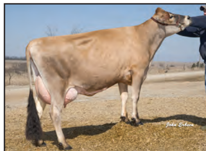
HEARTLAND JACE ADDISON-ET Sister to the Grandam of Lot 2534

WOODSTOCK LEMVIG LINDY 90% USA 111360167 TATTOO W505 / W505 DHIA HERD # 93-34-0279 CONTROL # 4505 1-11 305 2 15040 4.9 736 3.9 586 100DCR 1992C 3-01 305 2 21290 4.6 989 3.8 802 89DCR 2696C 305 2X ME AVG 2L 20374M 964F 784P 2632C PPA -1674M -23F -9P / YD -1431M -18F -6P CDCB PTA 12/01/2014 2RECS 77%R 50%ILE -257M -6F 0P 48CM$ 35NM$ 3FM$ 47GM$ 0.4PL 0.2DPR 1.0CCR 2.2HCR 3.00SCS AJCA 12/01/2014 PTAT 70%R 0.8 JUI 17.2 JPI 71%R 24