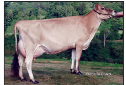
SUNSET CANYON CENTURION MAID Great-Grandam of Lot 880