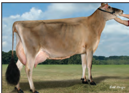
HEARTLAND ARTIST SALINA Dam of Lot 2056