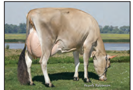
THREE VALLEYS COUNTRY MAID 3-ET Grandam of Lot 880