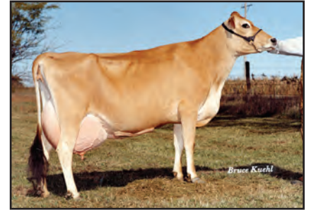
BEACHY BERRETТА SPICE Grandam of Lot 2736