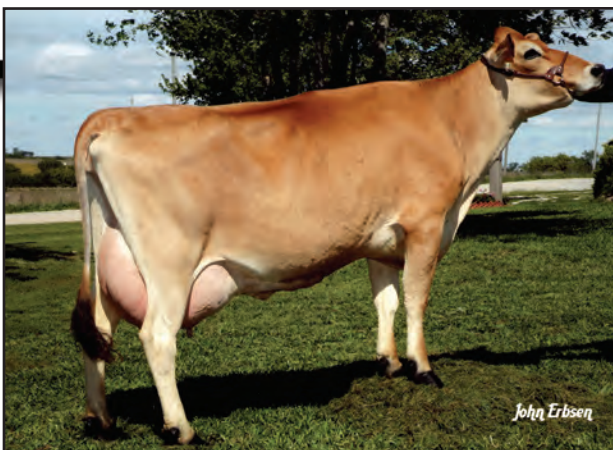
HEARTLAND JENETTA BILL DAY, E-90% Fourth Dam of Lot 2888