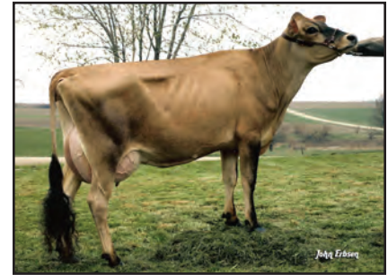
SUMMETZ GOLDEN BING BERGET-ET Great-Grandam of Lot 2887

HEARTLAND NATHAN TEXAS-ET 95% USA 067041437 GT50K JH1F JH2F DHIA HERD # 48-89-0168 CONTROL # 1437 2-10 305 3 21850 4.6 1008 3.9 843 93DCR 2785C 3-11 305 3 26340 4.3 1130 3.8 991 92DCR 3185C 5-01 305 3 25940 4.6 1185 3.7 963 94DCR 3232C 7-00 183 3 17610 4.8 844 3.5 610 79DCR 2108C 305 2X ME AVG 5L 21944M 1006F 828P 2737C PPA 1815M 28F 72P / YD 1062M 25F 49P CDCB GPTA 03/03/2015 5RECS 86%R 89%ILE 234M 4F 15P 214CM$ 198NM$ 160FM$ 122GM$ 3.4PL -1.8DPR -1.0CCR 0.1HCR 2.91SCS AJCA 03/03/2015 GPTAT 79%R 1.2 GJUI 17.0 GJPI 78%R 70