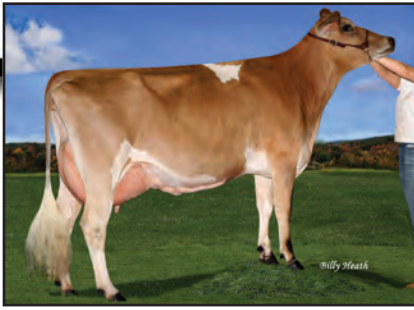
DEERVIEW MERCHANT COED Sister to Lot 12336