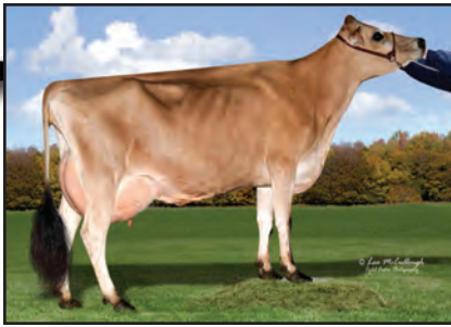
DEN-KEL JOAN-ET Dam of Lot 881