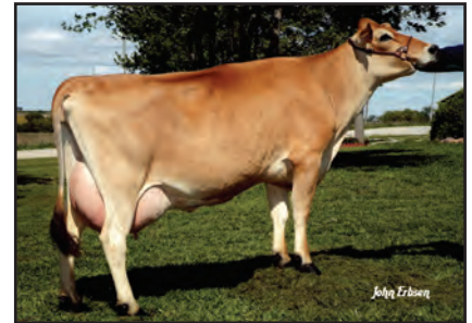
HEARTLAND JENETTA BILL DAY Sister to the Grandam of Lot 2629