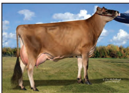
HEARTLAND ACTION KAVA-ET Sister to the Dam of Lot 2850