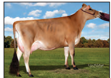
HEARTLAND TOPEKA MADALYN-ET Sister to Lot 2702