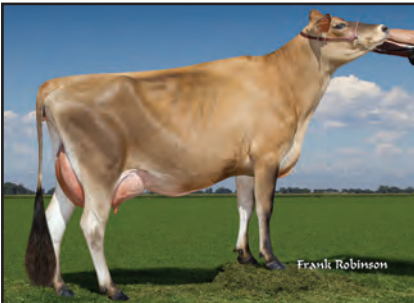
BW RENEGADE KATIE ET749-ET Sister to the Dam of Lot 12336