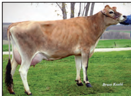
HEARTLAND QUEST BREEZE Great-Grandam of Lot 2844