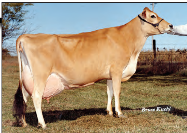
BEACHY BERRETTA SPICE, E-92% Fourth Dam of Lot 2946