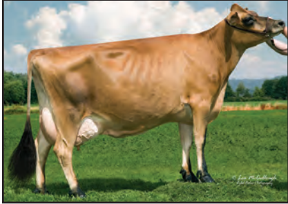
DEN-KEL IMPULS JULIE TOO Great-Grandam of Lot 2948

BRED: 10/16/2014 DUE: 07/22/2015 TO VERMALAR ULYSSE-ET USA 067012181 147JE6212 CDCB GPTA 12/01/2014 69%R 155M 0.19% 40F 89%ILE 70%R 0.08% 20P 405CM$ 375NM$ 304FM$ 338GM$ 4.1PL 0.5DPR 0.5CCR 1.4HCR 2.88SCS AJCA 12/01/2014 ODAUS GPTAT 68%R 1.6 GJUI 15.2 GJPI 65%R 141