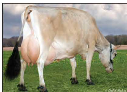
AHLEM B JOHN PRINCESS 3183-ET Great-Grandam of Lot 2767