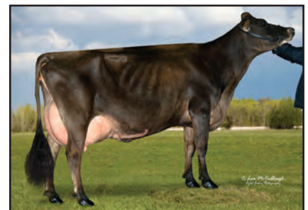
DEN-KEL JACINTO CONDOLLEEZA Sister to the Grandam of Lot 2915

4TH DAM: DEN-KEL PATRON GEORGIA 80% 4-09 305 2 27140 3.9 1070 3.7 994 100DCR 3093C