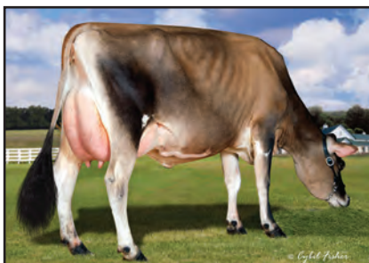
HEARTLAND VALENTINO SALINA I-ET Sister to Lot 2056