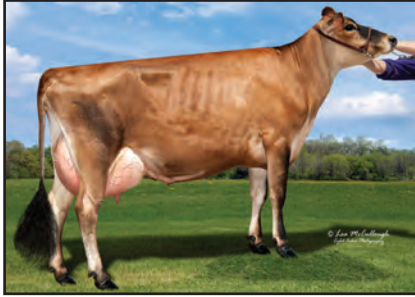
HEARTLAND IMPRESS TOPANGA-ET Sister to the Dam of Lot 1719