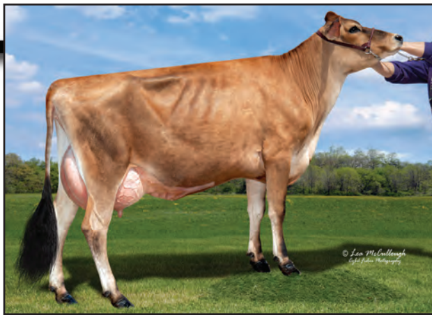
HEARTLAND PREMIER UNIQUE, VG-83% Sister to Lot 2912