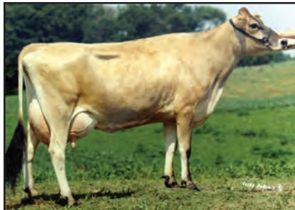
SUNNY DAY BERRETTA BETH-ET Great-Grandam of Lot 2719