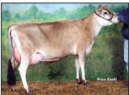
HEARTLAND BERRETTA AUGUST FIVE Sister to the Grandam of Lot 2857