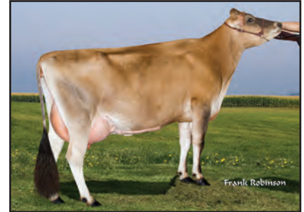
GR OOMSDALE CASEY CELEBRITY CHEYANN-ET Dam of Lot 22874

4TH DAM: OOMSDALE ALF GLORIA GOLDIE 90% 2-00 305 3 18770 6.0 1135 4.1 765 DHIR 2491C