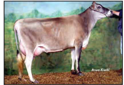
HEARTLAND HALLMARK ALTHEA Sister to the Grandam of Lot 2734