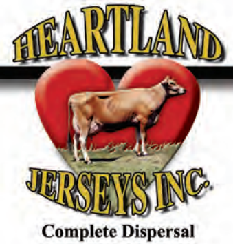
HEARTLAND TOPSIDE NEON, E-90% Fourth Dam of Lot 2891