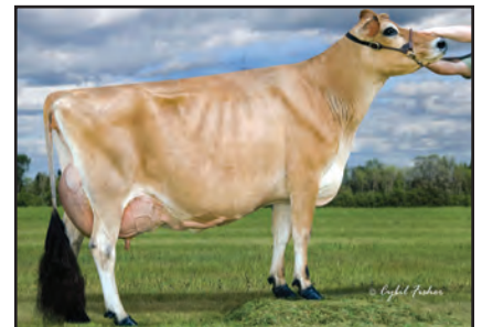
SUMMETZ JACE SUE SAVANNAH Grandam of Lot 2713

4TH DAM: SUMMETZ LESTER BITTER SWEET 81% 4-00 305 2 18600 4.4 819 3.7 693 DHIR 2213C