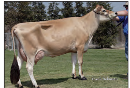
D&E PARAMOUNT VIOLET Dam of Lot 1696