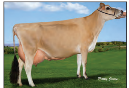
GABYS ARTIST AMBROSIA Sister to the Grandam of Lot 11847