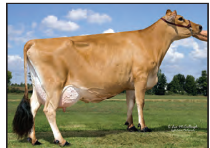
HEARTLAND ILSLEV DAMYEN Sister to the Grandam of Lot 2413