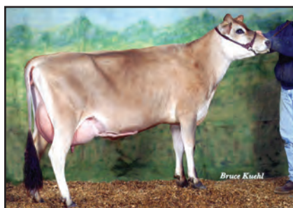
HEARTLAND BERRETTA AUGUST FIVE Sister to the Grandam of Lot 2560

1-09 292 3 15200 4.8 731 3.9 592 91DCR 1992C 2-09 121 3 7953 4.8 385 3.7 291 RIP 19299 871 715 PME 305 2X ME AVG 1L 18328M 879F 724P 2413C