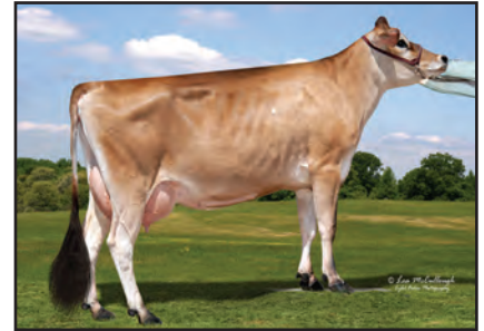
GABYS NAVARA ALMA-ET Selling as Lot 11847

GABYS HERMITAGE ROXETTE 90% 4-01 305 2 21640 4.9 1060 3.7 799 DHIR 2598C