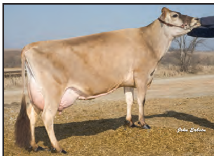
HEARTLAND JENETTA BILL PHOENIX Sister to the Grandam of Lot 2534

SIRE: FOREST GLEN MECCAS JEVON-ET JPI 45 37%ILE