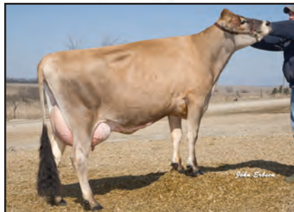
HEARTLAND JACE ADDISON-ET Grandam of Lot 2924