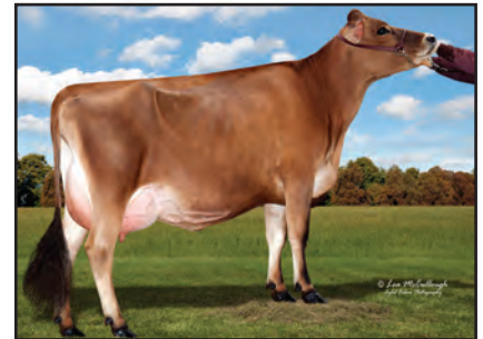
HEARTLAND TOPEKA MIA Selling as Lot 2702

4TH DAM: HILL TOP SAMBO MONICA 91% 3-10 305 2 14160 4.6 649 3.5 489 95DCR 1690C