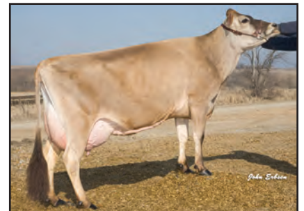
HEARTLAND JENETTA BILL PHOENIX Sister to the Grandam of Lot 2696