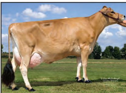
HEARTLAND ABE DALE-ET Sister to the Grandam of Lot 2892

BW LEGION USA 110226426 GT50K JH1F JH2C 505JE101 CDCB GPTA 12/01/2014 3543DAUS 797HRDS 3%RIP 99%R -266M 0.11% 8F 9%ILE 99%R 0.00% -10P -1CM$ ONMS 1FM$ -51GM$ 0.9PL -1.3DPR -2.4CCR -2.3HCR 2.94SCS AJCA 12/01/2014 2553DAUS GPTAT 99%R 1.3 GJUI 16.0 GJPI 99%R -16