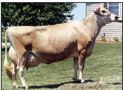
HEARTLAND BERRETTA ASHLYN Sister to the Grandam of Lot 2857