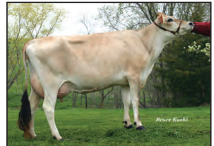
HEARTLAND MANNIX DOVE Great-Grandam of Lot 2944

HEARTLAND IMPULS DOVER-ET 72% USA 067041327 GT TATTOO / 1327 DHIA HERD # 48-89-0168 CONTROL # 1327 2-01 305 3 21290 4.6 972 3.6 759 92DCR 2606C 3-03 305 3 21090 4.4 929 3.6 757 92DCR 2536C 4-04 305 3 21980 4.2 926 3.7 806 92DCR 2601C 5-08 274 3 19860 5.0 999 3.7 732 93DCR 2532C 305 2X ME AVG 4L 19974M 916F 734P 2466C PPA 702M -21F 9P / YD 611M -9F 9P CDCB PTA 12/01/2014 4RECS 60%R 43%ILE 250M -3F 4P 6CM$ 9NM$ 15FM$ 43GM$ -0.1PL 1.4DPR 1.9CCR -0.2HCR 2.88SCS AJCA 12/01/2014 PTAT 48%R -0.9 JUI -16.8 JPI 49%R 13