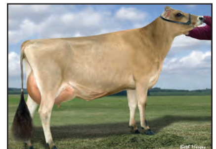
HILL TOP JARRETT MARIAH Sister to the Dam of Lot 2755