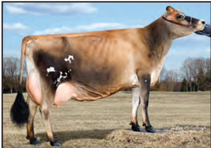
DEN-KEL SUGAR DADDY JULIE THREE Sister to the Grandam of Lot 2948

SISTER(S): DEN-KEL SUGARDADDY JULIE THREE 92% 4-02 305 2 18490 5.7 1054 4.0 743 102DCR 2573C DEN-KEL JEVON JERRY-ET 88% 1-10 305 3 22210 4.8 1068 3.5 780 93DCR 2696C DEN-KEL JEVON JATTY-ET 86% 5-01 305 2 21820 5.3 1156 4.1 885 100DCR 3065C DEN-KEL LOUIE JUSTINE-ET 84% 1-08 305 2 18450 5.0 929 3.8 699 100DCR 2418C GR DEN-KEL DALE JUSTA-ET 88% 3-02 305 2 26350 4.5 1177 3.4 884 102DCR 3053C DEN-KEL HANK JIGGLE-P-ET 86% 4-03 305 2 20940 4.4 920 3.7 783 97DCR 2560C DEN-KEL JUMP-ET 82% 1-07 305 2 17170 5.5 936 3.8 646 101DCR 2235C GR DEN-KEL JAMBOREE-ET 90% 3-06 305 2 14510 5.0 725 3.9 566 97DCR 1946C RANKS ON THE TOP 1-1/2% LIST FOR JPI