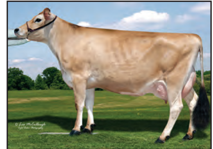
NORSE STAR RENEGADE MARLEY Selling as Lot 3223

SUNSET CANYON MAXIMUM-ET USA 111950696 GT50K JH1F JH2F 203JE607 CDCB GPTA 12/01/2014 11934DAUS 388HRDS 12%RIP 99%R -343M 0.41% 55F 61%ILE 99%R 0.09% 3P 261CM$ 238NM$ 182FM$ 230GM$ 1.4PL 0.6DPR 0.7CCR 1.2HCR 2.99SCS AJCA 12/01/2014 1866DAUS GPTAT 99%R -0.3 GJUI -6.3 GJPI 99%R 61