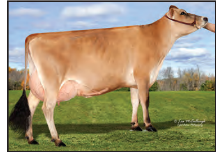
HEARTLAND LEGAL DUSTY Daughter of Lot 1605

SCHOOLEY LAD DOT 80% 3-00 304 2 15000 4.2 636 3.6 536 DHIR 1715C