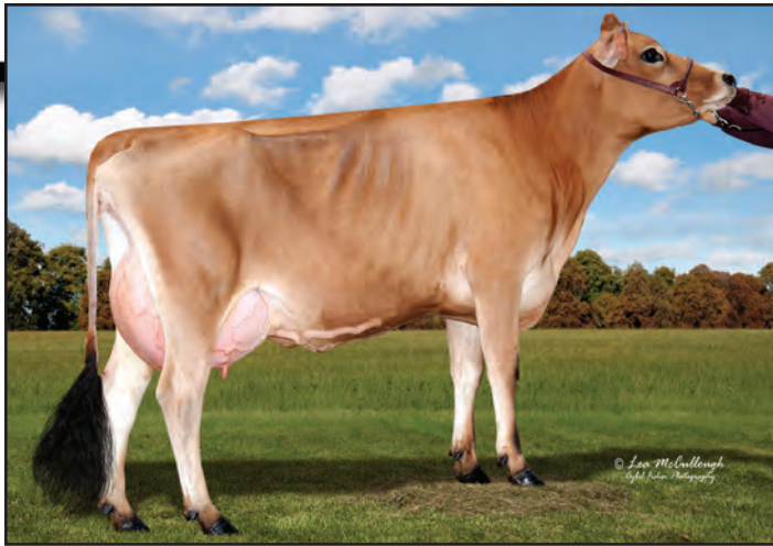
Selling as Lot 2705