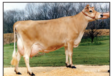
GABYS HERMITAGE ROXETTE Fourth Dam of Lot 11847