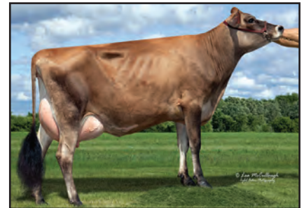
HEARTLAND RUBEX NAOMI-ET Sister to the Dam of Lot 2932