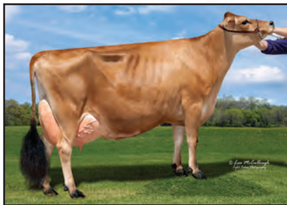
HEARTLAND IMPULS LAVONNE Sister to Lot 2193