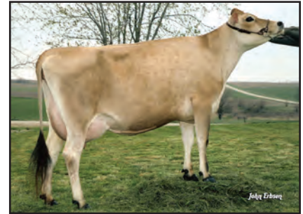
HEARTLAND IMPULS DAWSON-ET Grandam of Lot 2413

HEARTLAND CIMARRON DAWNA 83% 2-10 305 2 19120 3.9 755 3.7 711 DHIR 2136C