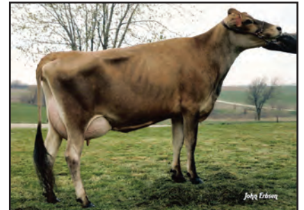
HEARTLAND IMPULS DONNA-ET Dam of Lot 1954