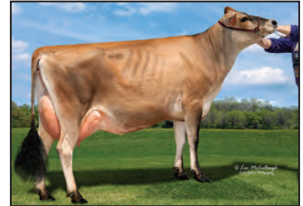
HEARTLAND ECLIPSE NIKE Sister to the Dam of Lot 2611

USA 114714077 GT3K JH1C TATTOO / 95% W339 DHIA HERD # 33-87-0722 CONTROL # 10 3-09 305 2 20550 4.8 990 3.9 801 102DCR 2697C 4-10 305 2 21410 4.8 1026 3.8 823 102DCR 2785C 5-10 305 2 20460 4.9 996 4.0 810 102DCR 2720C 7-01 305 2 16950 4.6 780 3.6 611 102DCR 2094C 305 2X ME AVG 6L 20234M 990F 781P 2648C PPA -188M 75F 46P / YD -970M 37F 13P CDCB GPTA 03/03/2015 5RECS 83%R 70%ILE -330M 14F 6P 135CM$ 105NM$ 35FM$ 62GM$ 0.9PL -1.0DPR -2.5CCR -1.4HCR 2.95SCS AJCA 03/03/2015 GPTAT 78%R 1.0 GJUI 12.9 GJPI 78%R 32