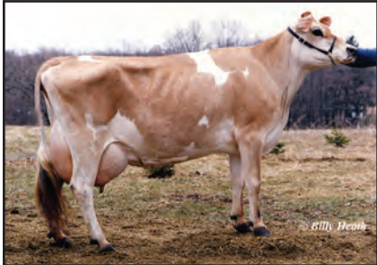
HOLLYROCK MARCUS JULIE Fifth Dam of Lot 2948

DEN-KEL JOAN-ET 90% USA 067100758 GT 3K JH1F DHIA HERD # 21-18-0569 CONTROL # 758 1-08 305 2 20630 4.4 914 3.7 762 101DCR 2520C 3-00 305 2 21820 4.8 1050 3.8 833 100DCR 2837C 305 2X ME AVG 2L 26368M 1208F 992P 3310C PPA 2834M 65F 115P / YD 2447M 66F 101P CDCB GPTA 03/03/2015 2RECS 76%R 99%ILE 696M 13F 30P 455CM$ 434NM$ 384FM$ 424GM$ 6.2PL 2.2DPR 2.5CCR 1.7HCR 2.79SCS AJCA 03/03/2015 GPTAT 74%R 0.9 GJUI 17.0 GJPI 71%R 190