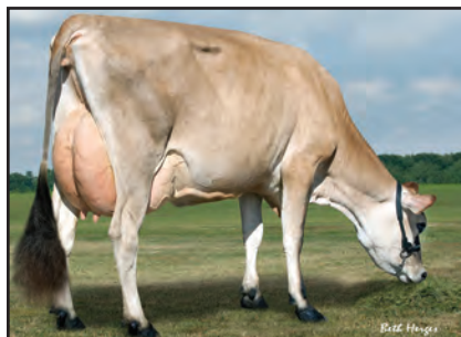
WAUNAKEE JEVON PROMIS 2058-ET Sister to Lot 2332