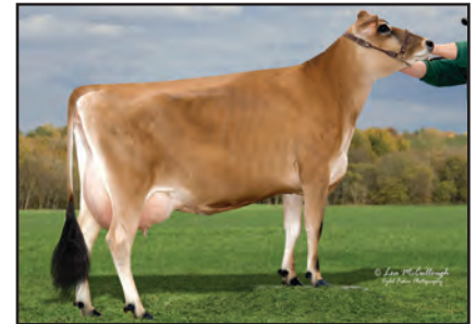
HEARTLAND LETTERMAN SOPHIA Sister to the Dam of Lot 2736