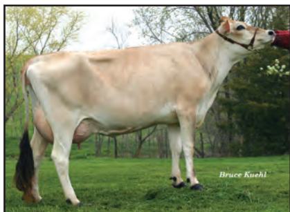
HEARTLAND MANNIX DOVE Sister to the Grandam of Lot 2739