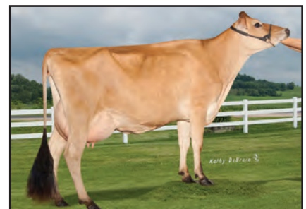
TJF/LEE RILEY MAMME 938-ET Sister to the Grandam of Lot 2723

SISTER(S): VANTAGE CURTIS MAME 90% 2-11 292 3 23150 4.0 927 3.3 759 88DCR 2532C VANTAGE REBEL MACY-ET 90% 6-08 305 2 18360 4.8 875 3.6 659 104DCR 2278C VANTAGE KLASSIC MARIE-ET 86% 2-10 305 2 21120 5.1 1083 3.5 731 102DCR 2526C TJF/LEE LEXNTN MAMME 792 87% 4-01 305 2 20390 5.3 1086 3.9 802 96DCR 2776C TJF/LEE ACTION MAMME 836-ET 88% 5-00 305 3 26130 3.8 1001 3.4 891 93DCR 2836C TJF/LEE ACTION MAMME 838-ET 88% 4-03 305 2 20030 4.8 962 3.8 754 102DCR 2585C TJF/LEE ACTION MAMME 840-ET 90% 4-05 305 2 20350 4.6 937 3.2 660 71DCR 2278C TJF/LEE ACTION MAMME 841-ET 91% 4-09 305 3 21620 5.3 1148 3.6 780 94DCR 2697C TJF ACTION MAMME 848-ET 91% 5-00 305 2 15940 4.9 789 3.5 556 96DCR 1921C TJF/LEE ACTION MAMME 850-ET 85% 3-02 305 2 11420 5.4 613 3.8 436 98DCR 1508C TJF/LEE ACTION MAMME 851-ET 86% 2-04 305 2 9360 4.8 450 3.7 345 97DCR 1193C TJF/LEE CELEBRITY MAMME 915-ET 88% 3-04 305 3 18220 4.7 860 3.5 640 95DCR 2212C TJF/LEE Tbone MAMME 924-ET 90% 3-08 305 2 15510 4.6 708 3.7 580 97DCR 1938C TJF/LEE RILEY MAMME 938-ET 88% 3-06 305 3 23590 5.1 1207 3.6 850 93DCR 2939C TJF/LEE VALENTINO MAMME 980-ET 85% 2-01 305 2 17210 5.1 871 3.8 646 100DCR 2235C TJF/LEE VALENTINO MAMME 983-ET 90% TJF/LEE ECLIPES MAMME 63-ET 88% 2-02 305 2 17620 5.1 899 3.3 589 104DCR 2034C TJF/LEE ECLIPES MAMME 67-ET 86% TJF/LEE ECLIPES MAMME 69-ET 85% 1-11 305 2 13230 4.8 629 3.3 440 95DCR 1519C TJF/LEE KYROS MAMME 99-ET 85% 2-02 305 2 16680 4.8 793 3.6 596 104DCR 2060C