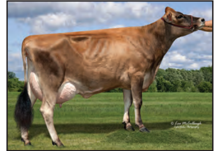
HEARTLAND LOTTO FLAIR Selling as Lot 2201