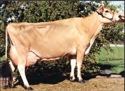
BW LEGION GALIANA ET629-ET Sister to the Dam of Lot 12336