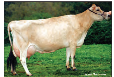
TENN HAUG E MAID Fourth Dam of Lot 880