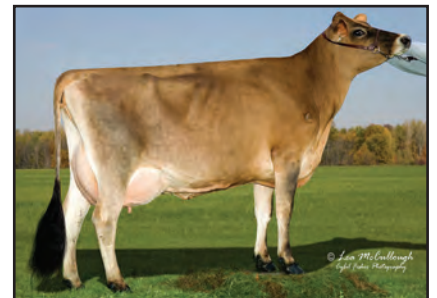
PATS PERFECT PHOEBE Great-Grandam of Lot 2922