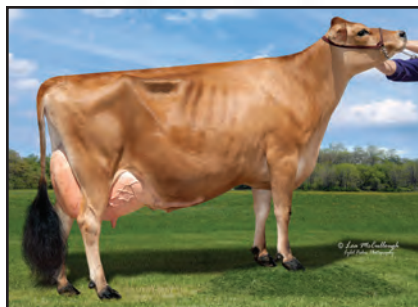
HEARTLAND IMPULS LAVONNE Sister to Lot 2819