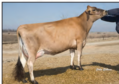
HEARTLAND ACTION CHLOE Grandam of Lot 2815