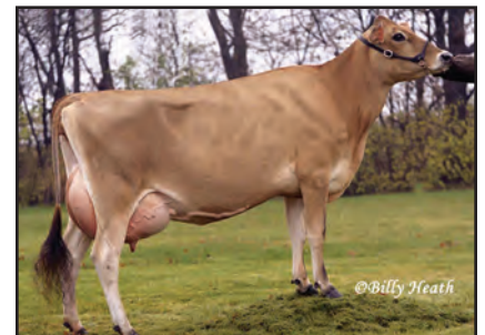
DUPAT BILL J832 Great-Grandam of Lot 908