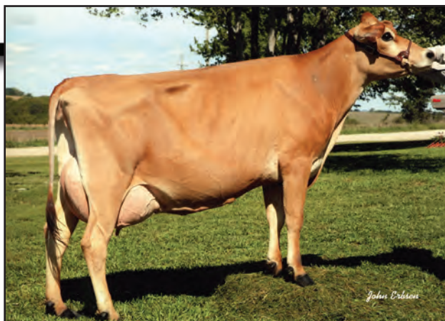
HEARTLAND LEGION CHARLEY, E-91% Great-Grandam of Lot 2747