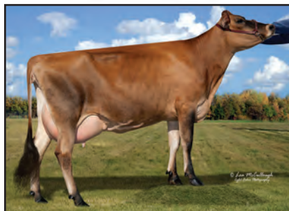
HEARTLAND TBONE DENMARK-ET Dam of Lot 2464