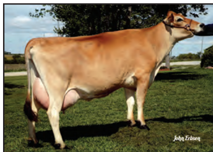
HEARTLAND JENETTA BILL DAY Sister to the Grandam of Lot 2745