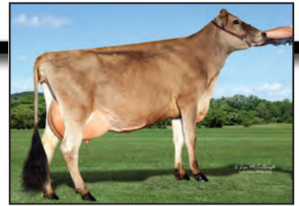
DEN-KEL DIMENTION POLLY-ET Full Sister to Lot 908

FRESH: 04/25/2014 BRED: 02/16/2015 DUE: 11/22/2015 TO HI-LAND SCORE FORMIDABLE USA 067247473 1JE882 CDCB GPTA 12/01/2014 66%R 1610M -0.22% 37F 98%ILE 68%R -0.06% 46P 519CM$ 522NM$ 527FM$ 465GM$ 6.0PL 0.6DPR 1.3CCR 0.2HCR 2.94SCS AJCA 12/01/2014 ODAUS GPTAT 67%R 1.0 GJUI 6.8 GJPI 63%R 210 RANKS ON THE TOP 1-1/2% LIST FOR GJPI 58.7 LBS. MILK ON MARCH TEST SCC: 44,000