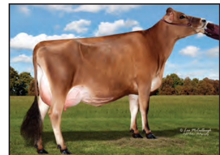
HEARTLAND TOPEKA MIA Daughter of Lot 3223

SIRE: ISDK Q IMPULS JPI 121 75%ILE NEXT DAM: HILL TOP SAMBO MONICA 91% 3-10 305 2 14160 4.6 649 3.5 489 95DCR 1690C SIRE: LESTER SAMBO JPI -59 6%ILE