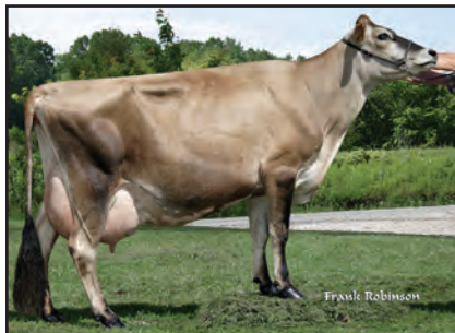
SUNBOW DUNKIRK EMPRESS-ET Sister to the Grandam of Lot 2791

4TH DAM: SUNBOW KHAN PEARL-ET 85% 3-11 305 2 23820 4.6 1093 3.7 874 92DCR 2842C