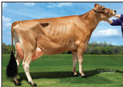
HEARTLAND VALENTINO DIANNA Selling as Lot 2290