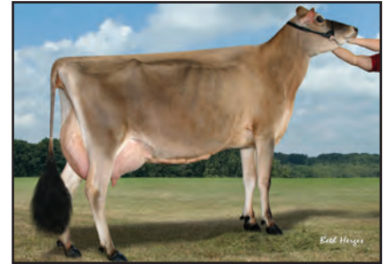
HEARTLAND ARTIST SALINA From the same family as Lot 2790