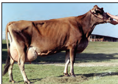
HEARTLAND BARBER NIKE Sister to the Grandam of Lot 2808

FRESH: 08/15/2014 BRED: 11/25/2014 DUE: 08/31/2015 TO RIVER VALLEY PF MEGAPOWER-ET JE840003012423848 7JE5011 CDCB GPTA 12/01/2014 67%R 731M 0.14% 60F 94%ILE 68%R 0.02% 30P 428CM$ 414NM$ 380FM$ 346GM$ 2.9PL -1.2DPR -0.3CCR 1.0HCR 2.99SCS AJCA 12/01/2014 ODAUS GPTAT 67%R 1.6 GJUI 17.9 GJPI 63%R 152 RANKS ON THE TOP 1-1/2% LIST FOR JPI 38.1 LBS. MILK ON MARCH TEST SCC: 132,000