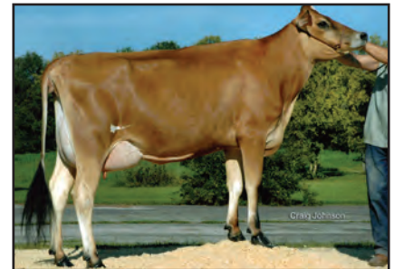
GABYS NATHAN ASTORIA-ET Grandam of Lot 11847