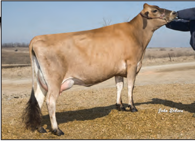
HEARTLAND ACTION CHLOE, VG-85% Great-Grandam of Lot 2759