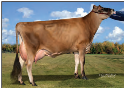
HEARTLAND ACTION KAVA-ET Sister to Lot 2163