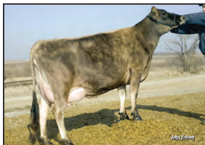
HEARTLAND MANHATTEN BONNIE Sister to the Dam of Lot 2628