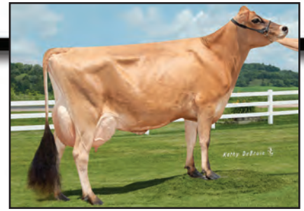
ALL LYNNS LOUIE VENETIA-ET Sister to Lot 1696

4TH DAM: D&E BERRETTAS VIOLET BELL 80% 4-10 305 2 17200 4.8 824 3.7 638 101DCR 2203C