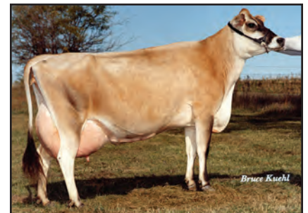
HEARTLAND KHAN ALEXA Fifth Dam of Lot 2696