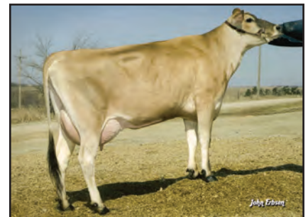
HEARTLAND ACTION AVIS Sister to the Grandam of Lot 2201