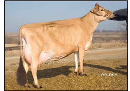
HEARTLAND ILSLEV DAMYEN Sister to the Grandam of Lot 2130

ISDK Q IMPULS JEDNK000000301592 GT HD JH1F JH2F 236JE3 CDCB GPTA 12/01/2014 29911DAUS 2827HRDS 11%RIP 99%R 52M 0.20% 39F 75%ILE 99%R 0.13% 25P 328CM$ 290NM$ 198FM$ 314GM$ 1.6PL 1.9DPR 2.6CCR 0.1HCR 3.10SCS AJCA 12/01/2014 16366DAUS GPTAT 99%R 0.0 GJUI -2.4 GJPI 99%R 121