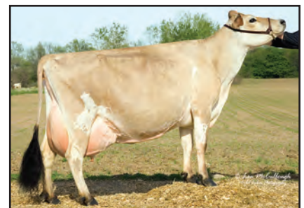
DEN-KEL HANK CLARISSA Sister to the Grandam of Lot 2915

DEN-KEL LOUIE CLARABELLE 85% USA 067049549 GT JH1F DHIA HERD # 21-18-0569 CONTROL # 549 2-00 301 2 20790 5.7 1188 4.0 825 100DCR 2856C 3-00 305 2 22190 5.7 1257 3.9 856 102DCR 2962C 4-02 305 2 21590 5.2 1125 4.1 889 102DCR 3037C 5-06 305 2 22040 5.9 1298 4.0 879 101DCR 3043C 7-01 305 2 20340 5.0 1013 4.0 804 100DCR 2738C 305 2X ME AVG 5L 22758M 1258F 909P 3130C PPA 1327M 122F 88P / YD 631M 78F 54P CDCB GPTA 03/03/2015 5RECS 74%R 85%ILE 134M 24F 18P 198CM$ 174NM$ 116FM$ 219GM$ 0.6PL 2.4DPR 0.8CCR 0.5HCR 2.99SCS AJCA 03/03/2015 GPTAT 69%R -0.3 GJUI -7.3 GJPI 66%R 88