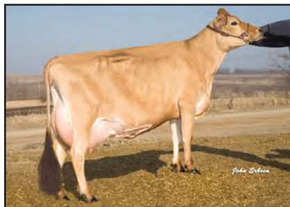
HEARTLAND ILSLEV DAMYEN Grandam of Lot 1984