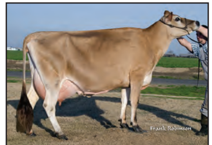
D&E ABE VIOLET Grandam of Lot 1696

SIRE: HEARTLAND MERCHANT TOPEKA-ET USA 067332021 GT50K JH1F JH2F 7JE1169 CDCB GPTA 12/01/2014 316DAUS 25HRDS 98%RIP 96%R 262M 0.14% 37F 75%ILE 96%R 0.04% 17P 308CM$ 291NM$ 251FM$ 182GM$ 3.0PL -2.8DPR -2.9CCR -1.8HCR 2.96SCS AJCA 12/01/2014 31DAUS GPTAT 83%R 1.8 GJUI 24.7 GJPI 88%R 85