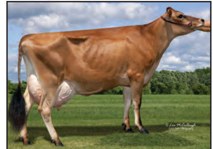
BAF TBONE OLATHE OF HLJ-ET Selling as Lot 2125