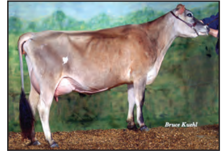
HEARTLAND MOR TULSA Sister to the Grandam of Lot 2879

HEARTLAND ABE DAKOTA 87% USA 067101573 GT50K JH1F JH2F TATTOO / 1573 DHIA HERD # 48-89-0168 CONTROL # 1573 3-11 305 3 21670 5.6 1224 4.1 880 94DCR 3048C 5-08 305 3 18980 5.7 1084 4.1 769 95DCR 2663C 7-03 305 3 21190 5.5 1159 3.8 804 94DCR 2782C 362 3 24038 5.6 1352 3.9 940 DHIR 3254C 305 2X ME AVG 4L 18488M 1042F 754P 2602C PPA 309M 65F 43P / YD 250M 46F 34P CDCB GPTA 03/03/2015 4RECS 83%R 92%ILE 210M 22F 14P 234CM$ 218NM$ 182FM$ 199GM$ 2.8PL 0.2DPR 1.5CCR 0.4HCR 2.94SCS AJCA 03/03/2015 GPTAT 76%R -0.5 GJUI -5.5 GJPI 77%R 76