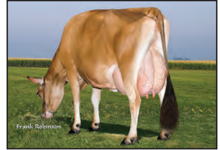
ALL LYNNS IMPULS VIRTUE-ET Sister to Lot 1696