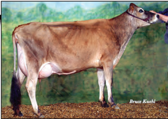
HEARTLAND GOLDEN BLURRY, E-90% Grandam of Lot 2548