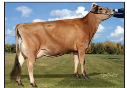
HEARTLAND ACTION SUNRISE Sister to the Dam of Lot 2684