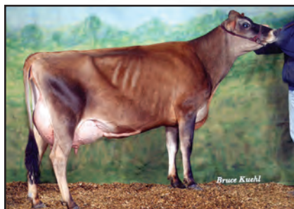
HEARTLAND BARKLY KELLY Sister to the Dam of Lot 2850