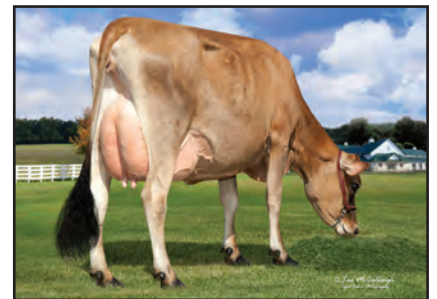
HI-KEL TBONE PFENNIG-ET Sister to the Grandam of Lot 2922