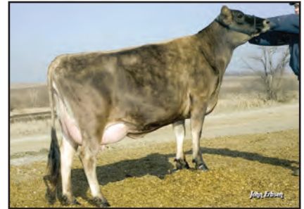
HEARTLAND MANHATTEN BONNIE Sister to the Dam of Lot 2593