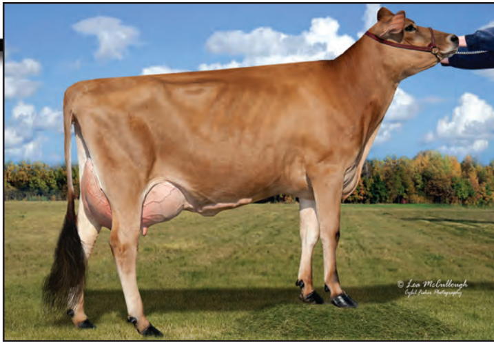
Selling as Lot 835