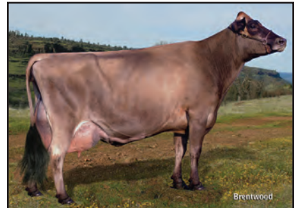
PR OOMSDALE GRATITUDE COUNTRY CASEY-ET Grandam of Lot 22874