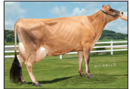
ALL LYNNS JEVON VARINA-ET Sister to Lot 1696