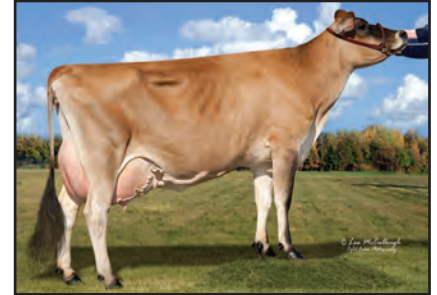
SUMMETZ MECCA SAVANNAH SHANNT-ET Dam of Lot 2713

FRESH: 05/13/2014 BRED: 10/23/2014 DUE: 07/29/2015 TO DP PREMIER FRANKLIN-ET USA 067431366 7JE1246 CDCB GPTA 12/01/2014 71%R -59M 0.25% 41F 72%ILE 72%R 0.10% 16P 312CM$ 279NM$ 199FM$ 265GM$ 1.9PL 0.9DPR -0.7CCR 0.1HCR 2.89SCS AJCA 12/01/2014 0DAUS GPTAT 70%R 1.0 GJUI 10.9 GJPI 68%R 110 76.3 LBS. MILK ON MARCH TEST SCC: 13,000