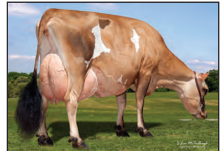
HEARTLAND NATHAN TEXAS-ET Sister to the Grandam of Lot 2773