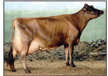
DUNCAN BELLE Full Sister to the Fourth Dam of Lot 2692