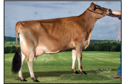
HI-KEL TBONE PHYLLLO-ET Sister to the Grandam of Lot 2922