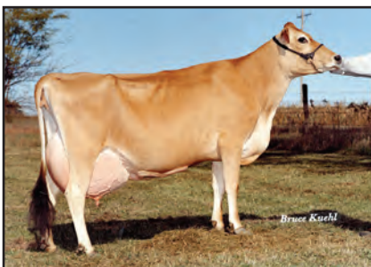
BEACHY BERRETTA SPICE Great-Grandam of Lot 2056