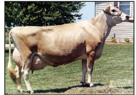
HEARTLAND BERRETTA ASHLYN Sister to the Grandam of Lot 1519

WINDY WILLOW MALCOLM JAQUENETTE 91% USA 003833041 TATTOO / DW10C DHIA HERD # 91-74-0564 CONTROL # 65 3-03 305 2 20620 4.6 947 3.7 759 DHIR 2468C 4-05 305 2 23270 4.5 1053 3.6 848 DHIR 2757C 5-05 305 2 25480 4.6 1168 3.6 923 DHIR 3001C 6-09 275 2 23200 4.4 1023 3.5 818 98DCR 2658C 305 2X ME AVG 5L 24217M 1067F 867P 2797C PPA 2975M 141F 101P / YD 496M 40F 21P CDCB PTA 12/01/2014 5RECS 70%R 28%ILE -206M 2F -2P -37CM$ -47NM$ -71FM$ 1GM$ -1.9PL 1.2DPR 1.0CCR -0.4HCR 2.90SCS AJCA 12/01/2014 PTAT 64%R -0.4 JUI -9.7 JPI 63%R -9