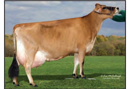
HI-LAND JACE LIGHT Grandam of Lot 2855