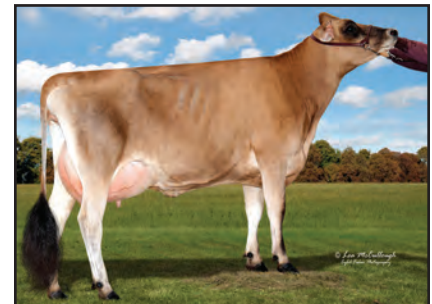
HEARTLAND FASTRACK JOLENE-ET Daughter of Lot 2298

AHLEM B JOHN PRINCESS 3183-ET 91% USA 067053183 GT JH1F TATTOO / T3183 DHIA HERD # 35-25-0350 CONTROL # 3183 1-10 305 2 26822 4.5 1202 3.2 867 95DCR 2993C 3-07 305 3 34400 4.4 1521 3.1 1069 90DCR 3688C 4-09 305 3 34660 5.0 1720 3.3 1130 91DCR 3901C 6-09 305 3 35900 4.8 1728 3.2 1153 94DCR 3980C 8-02 305 3 30160 4.5 1370 3.3 997 94DCR 3443C 9-03 305 3 31850 4.6 1472 3.4 1086 93DCR 3752C 305 2X ME AVG 6L 29886M 1399F 991P 3421C PPA 5211M 191F 145P / YD 2379M 56F 71P CDCB GPTA 03/03/2015 4RECS 83%R 88%ILE 565M -9F 11P 187CM$ 191NM$ 202FM$ 229GM$ 3.1PL 2.5DPR 3.1CCR 2.3HCR 2.78SCS AJCA 03/03/2015 GPTAT 77%R -0.1 GJUI 2.7 GJPI 77%R 93