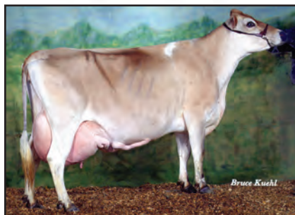
MONTANA AMMINITY Great-Grandam of Lot 2741