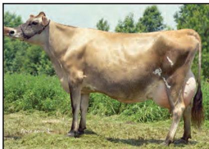
SUNNY DAY YANKEE BECKY Fourth Dam of Lot 2719