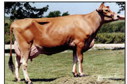
HEARTLAND DECLO DANA Fourth Dam of Lot 2836