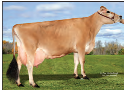
HEARTLAND SAWYER SUNCREST Sister to the Dam of Lot 2760