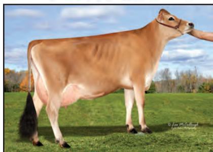
DEN-KEL LEGAL CENDRA-ET Selling as Lot 852