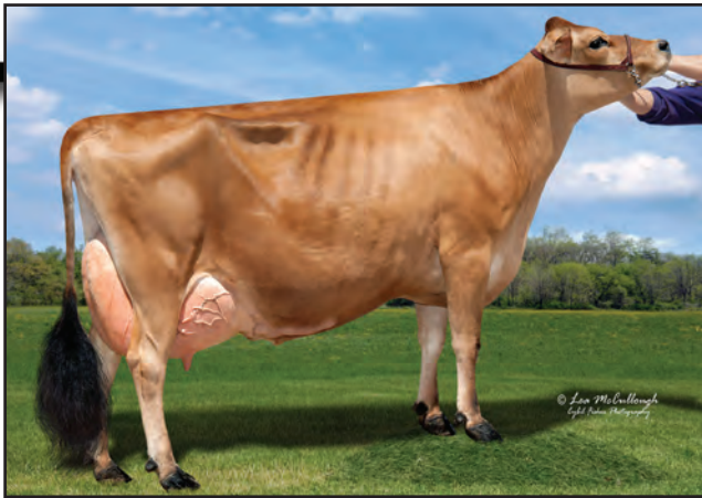
HEARTLAND IMPULS LAVONNE, E-92% Dam of Embryo