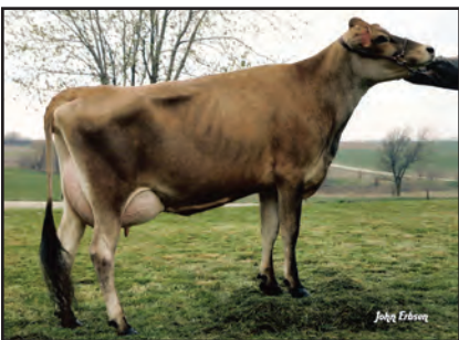
HEARTLAND IMPULS DONNA-ET Great-Grandam of Lot 2892

SUNSET CANYON MATINEE S BELLE 90% USA 115458011 GT50K JH1F JH2F TATTOO / C553 DHIA HERD # 92-23-0452 CONTROL # 1553 1-09 305 2 18470 4.9 914 3.5 652 92DCR 2254C 2-07 305 2 21380 5.0 1078 3.5 757 97DCR 2617C 4-00 305 2 21350 5.0 1069 3.5 743 97DCR 2568C 305 2X ME AVG 3L 23748M 1180F 838P 2896C PPA 1165M 116F 24P / YD 396M 71F -3P CDCB GPTA 03/03/2015 3RECS 85%R 68%ILE 89M 26F -6P 84CM$ 98NM$ 132FM$ 96GM$ 1.0PL 0.3DPR -1.0CCR 1.1HCR 2.99SCS AJCA 03/03/2015 GPTAT 80%R 0.6 GJUI 1.8 GJPI 80%R 18