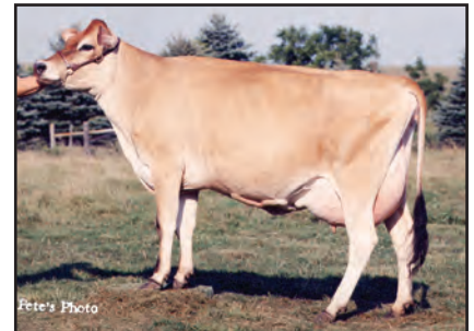
SUMMETZ LESTER BETTY BENOLA Great-Grandam of Lot 2084