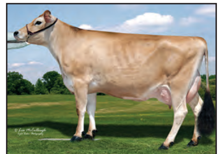
NORSE STAR RENEGADE MARLEY Dam of Lot 2702