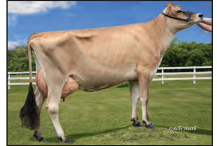
THREE VALLEYS TBONE C MAYBELL-ET Dam of Lot 880