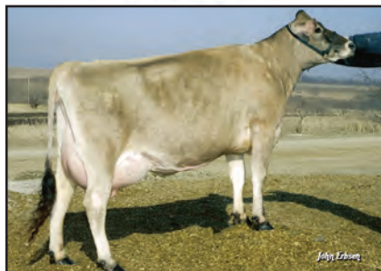
HEARTLAND KLASSIC IVORY Sister to the Dam of Lot 2857