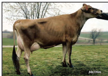
HEARTLAND IMPULS DONNA-ET Grandam of Lot 2594