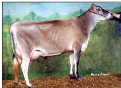
HEARTLAND HALLMARK ALTHEA Sister to the Grandam of Lot 2685