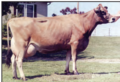
HEARTLAND TOPSIDE NEON Grandam of Lot 2808

ST SR DF RA RW RL FA 0.2 -0.2 -0.5 L0.0 -0.2 P0.7 S0.5 FU RH RUW UC UD TP TL 0.3 -0.4 -0.3 -0.3 S1.2 C0.2 L0.1