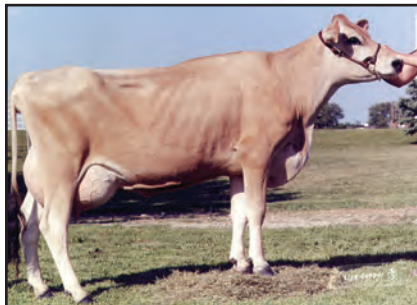
HEARTLAND MANNIX ALYSSA Fourth Dam of Lot 2712