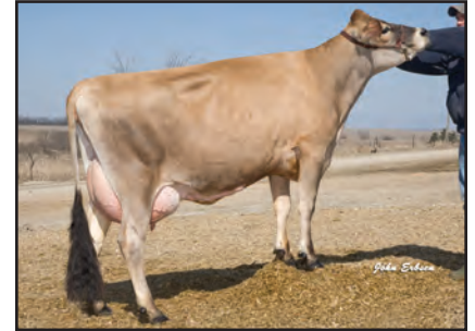
HEARTLAND JACE ADDISON-ET Grandam of Lot 2696

4TH DAM: HEARTLAND FLYER AMBER 87% 2-10 305 3 16440 5.2 856 4.1 673 92DCR 2306C