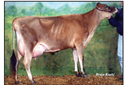
HEARTLAND PARAMOUNT BRYN-ET Grandam of Lot 2593