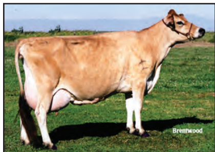
BW LAST CHANCE E914 Fifth Dam of Lot 2831

HEARTLAND NATHAN TEXAS-ET 95% USA 067041437 GT50K JH1F JH2F DHIA HERD # 48-89-0168 CONTROL # 1437 2-10 305 3 21850 4.6 1008 3.9 843 93DCR 2785C 3-11 305 3 26340 4.3 1130 3.8 991 92DCR 3185C 5-01 305 3 25940 4.6 1185 3.7 963 94DCR 3232C 7-00 183 3 17610 4.8 844 3.5 610 79DCR 2108C 305 2X ME AVG 5L 21944M 1006F 828P 2737C PPA 1815M 28F 72P / YD 1062M 25F 49P CDCB GPTA 03/03/2015 5RECS 86%R 89%ILE 234M 4F 15P 214CM$ 198NM$ 160FM$ 122GM$ 3.4PL -1.8DPR -1.0CCR 0.1HCR 2.91SCS AJCA 03/03/2015 GPTAT 79%R 1.2 GJUI 17.0 GJPI 78%R 70