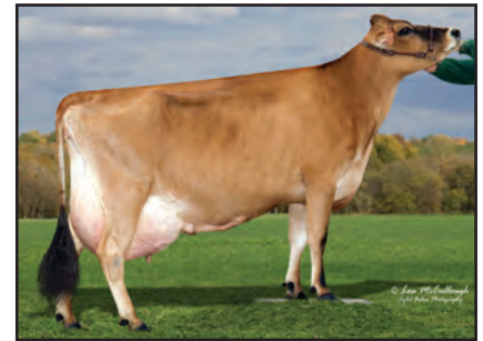
HI-LAND JACE LIGHT Grandam of Embryo