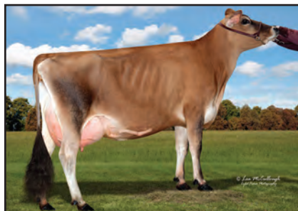
HEARTLAND TOPEKA ATHENA-ET Daughter of Lot 1725