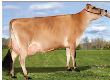
HEARTLAND LEGAL DUSTY Sister to Lot 2739