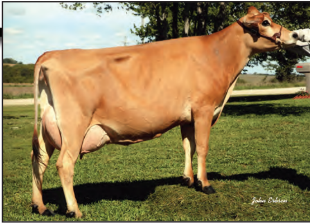
HEARTLAND LEGION CHARLEY, E-91% Grandam of Lot 2563