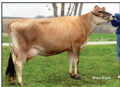
HEARTLAND KLASSIC ARIZONA Great-Grandam of Lot 2924