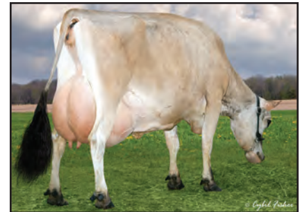
AHLEM B JOHN PRINCESS 3183-ET Great-Grandam of Lot 2746

GR WAUNAKEE DALE JOEY 2332-ET 85% USA 066438858 CT 50K JH1F JH2F DHIA HERD # 48-89-0168 CONTROL # 2332 1-08 305 3 20820 4.1 844 3.3 694 93DCR 2310C 2-11 305 3 21870 4.1 906 3.4 737 94DCR 2469C 4-03 305 3 12880 3.9 500 3.3 428 95DCR 1392C 5-10 51 3 3200 4.5 145 3.0 96 RIP 13939 812 485 PME 305 2X ME AVG 3L 18940M 778F 647P 2141C PPA 340M -104F -29P / YD 1111M -51F 6P CDCB GPTA 03/03/2015 3RECS 80%R 92%ILE 829M -4F 16P 210CM$ 224NM$ 256FM$ 236GM$ 4.3PL 2.3DPR 1.9CCR 1.7HCR 2.94SCS AJCA 03/03/2015 GPTAT 76%R 0.4 GJUI 4.3 GJPI 75%R 106 SELLING AS LOT 2332 SIRE: PR OOMSDALE JACE GRATIT GARDEN-ET JPI 108 66%ILE