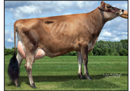
HEARTLAND RUBEX NAOMI-ET Sister to Lot 2834

HEARTLAND BERRETTA NAOMI 90% 4-02 305 3 18480 4.1 750 3.9 721 93DCR 2143C