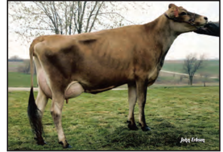
HEARTLAND IMPULS DONNA-ET Sister to the Grandam of Lot 2944

SR JACE PRONTO-P-ET 91% USA 114219321 GT50K JH1F JH2F TATTOO / Y37 DHIA HERD # 23-20-0326 CONTROL # 44 1-11 305 2 19730 3.7 738 3.3 643 95DCR 2070C 3-03 305 2 21720 3.6 789 3.4 736 97DCR 2282C 4-06 305 2 26010 3.9 1025 3.5 907 98DCR 2897C 305 2X ME AVG 3L 24790M 924F 838P 2640C PPA 3451M 47F 95P / YD 2258M 12F 62P CDCB GPTA 03/03/2015 3RECS 90%R 87%ILE 542M -2F 14P 181CM$ 184NM$ 190FM$ 150GM$ 3.6PL 0.4DPR -0.7CCR 0.6HCR 2.93SCS AJCA 03/03/2015 GPTAT 86%R 0.8 GJUI 4.2 GJPI 85%R 74