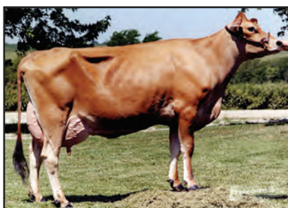
HEARTLAND DECLO DANA Great-Grandam of Lot 1984