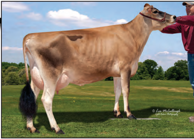
Selling as Lot 3873