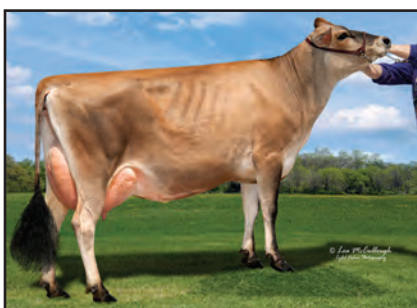
HEARTLAND ECLIPSE NIKE Sister to the Dam of Lot 2884

BW CENTURION IRIS K347 95% USA 111122015 GT50K JH1F JH2C TATTOO K347 / K347 DHIA HERD # 93-52-0150 CONTROL # 1057 6-09 305 3 34440 4.8 1655 3.5 1212 103DCR 4189C 365 3 39630 4.8 1895 3.5 1392 DHIR 4812C 9-04 305 3 31420 3.9 1233 3.0 939 103DCR 3237C 365 3 37050 4.0 1465 3.0 1109 DHIR 3824C 305 2X ME AVG 5L 24889M 1147F 823P 2840C PPA 2581M 99F 72P / YD 1466M 65F 45P CDCB GPTA 03/03/2015 4RECS 90%R 91%ILE 252M 7F 4P 209CM$ 216NM$ 233FM$ 243GM$ 3.4PL 2.3DPR 2.7CCR 1.2HCR 3.03SCS AJCA 03/03/2015 GPTAT 86%R 1.4 GJUI 22.1 GJPI 86%R 89