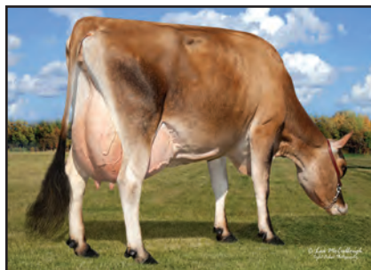
HEARTLAND ABE SUNSHINE Sister to the Dam of Lot 2760