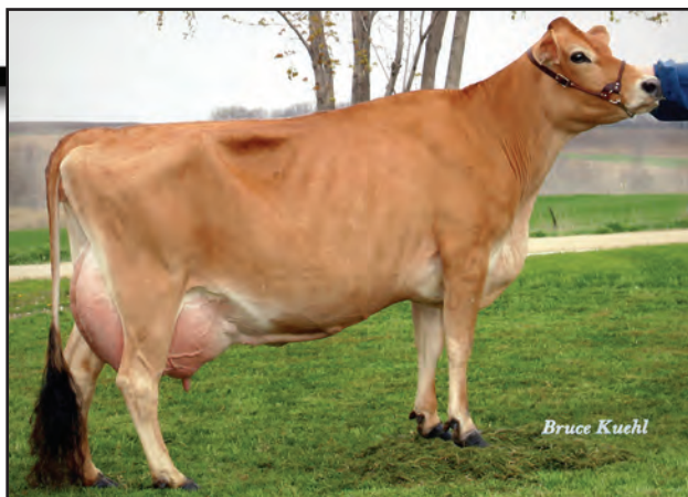
HEARTLAND DECLO PRIDE, E-90% Fourth Dam of Lot 2756