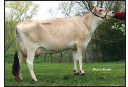
HEARTLAND MANNIX DOVE Great-Grandam of Lot 2742

4TH DAM: SCHOOLEY BERRETTA DONNA 84% 5-02 305 3 21640 3.9 842 3.3 721 94DCR 2283C