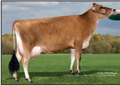
HEARTLAND JIMMIE TUCSON-ET Sister to the Dam of Lot 1719