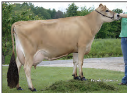
SUNBOW JACE MAJESTY-ET Sister to the Grandam of Lot 2791

FRESH: 12/27/2014 BRED: 03/27/2015 DUE: 12/31/2015 TO GR JARS OF CLAY INTREPID-ET USA 067450153 29JE3923 CDCB GPTA 12/01/2014 61%R 1234M 0.00% 58F 98%ILE 62%R -0.03% 37P 514CM$ 511NM$ 503FM$ 449GM$ 4.6PL -0.2DPR 0.4CCR 1.4HCR 2.86SCS AJCA 12/01/2014 ODAUS GPTAT 60%R 1.4 GJUI 18.6 GJPI 57%R 200 70.4 LBS. MILK ON MARCH TEST SCC: 174,000