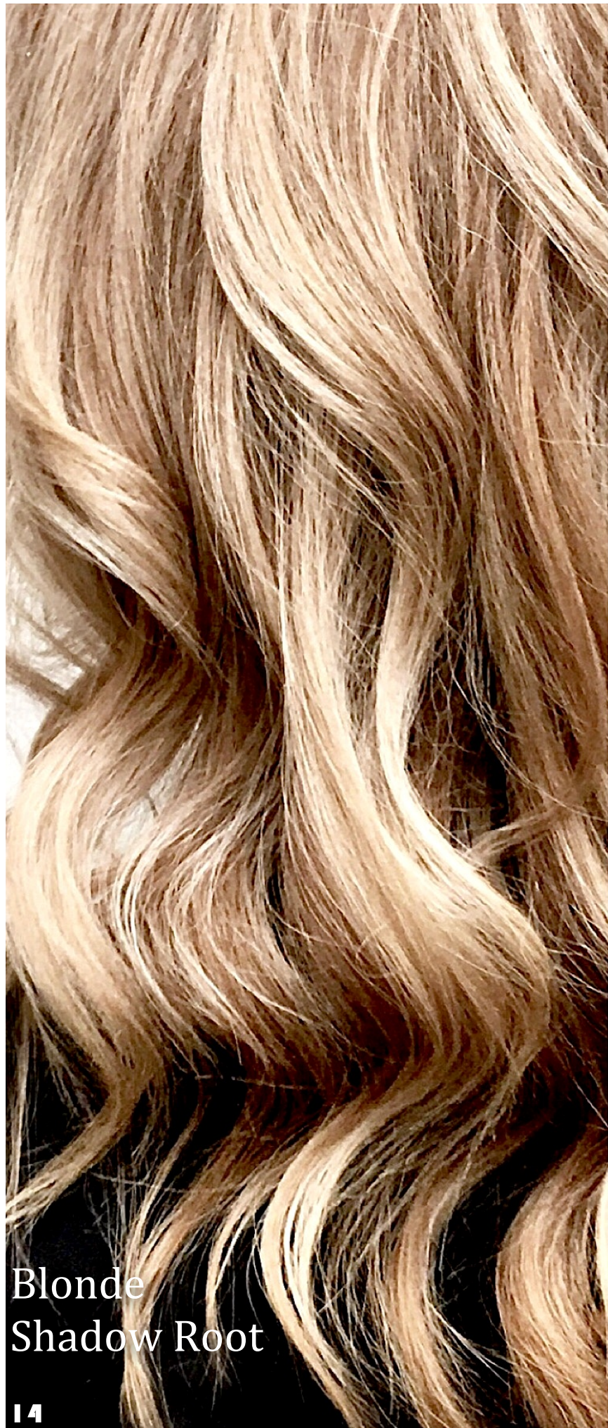
Blonde Shadow Root