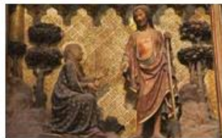
Christ and Mary Magdalene - relief from Notre-Dame cathedral in Paris

Easter is our opportunity to renew our faith and our commitment to Jesus and the teachings of the Gospel.