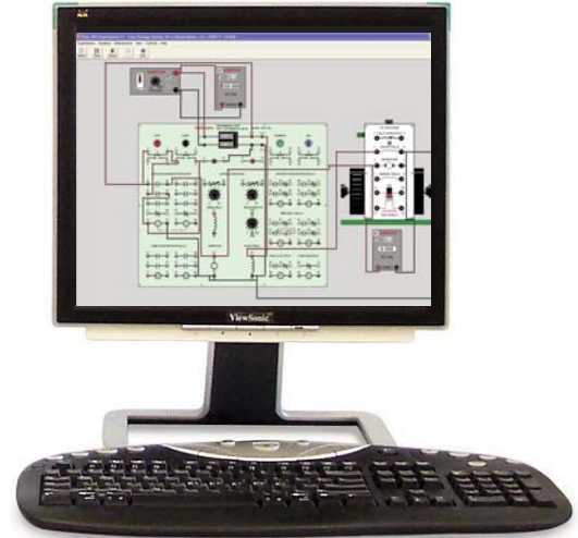
The Hampden SIM-200 Virtual Motors and Machines Software provides a “Virtual Workbench,” allowing students to assemble, test and analyze a large range of equipment.

Instructor access to student progress reports and quick quiz results are password protected under the program maintenance menu. Optional network setup centralizes instructor database information.