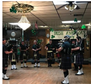
NM Fire & Police Pipes & Drums