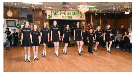
Celtic Steps Irish Step Dancers