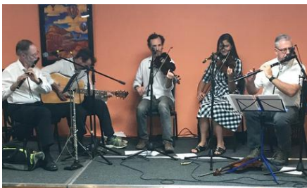
Duke City Ceili Band