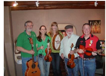
Rye Creek Band