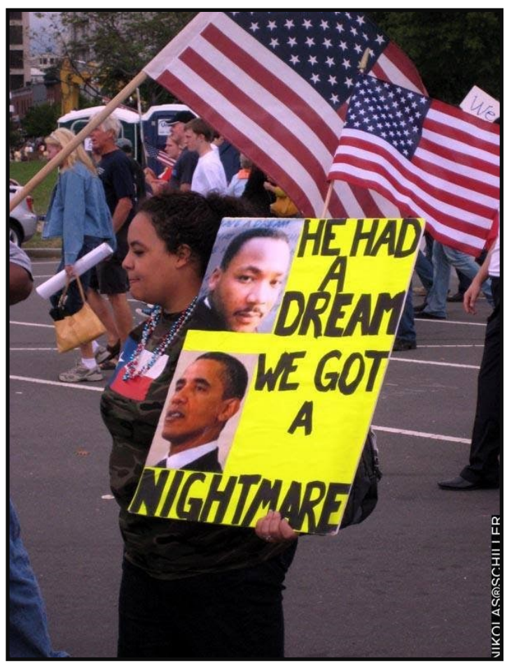
NUT AND YAHOO