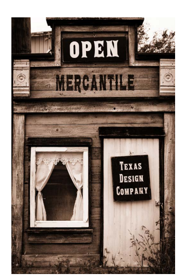
Finalist: Linda Youngblood