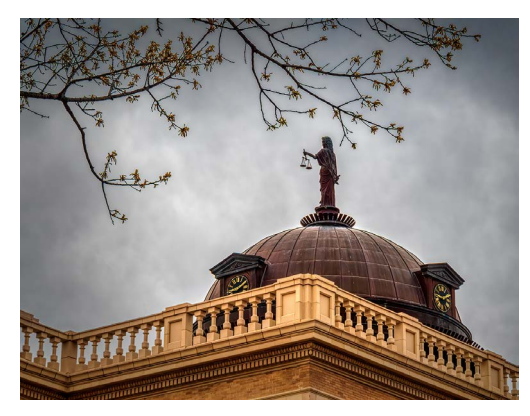
Finalist: Rose Epps