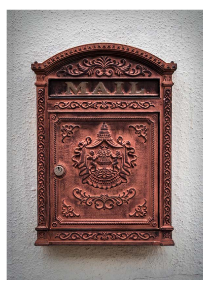
Finalist: Rose Epps