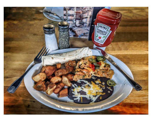
Finalist: Pete Holland