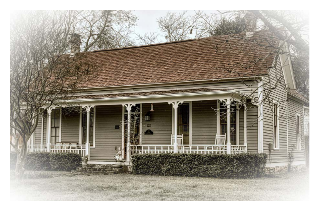
Finalist: Beverly Lyle