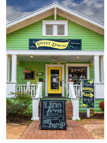
Finalist: R0se Epps