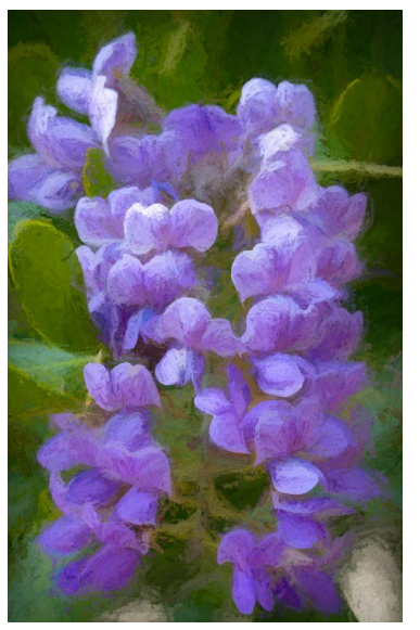
Finalist: Linda Youngblood