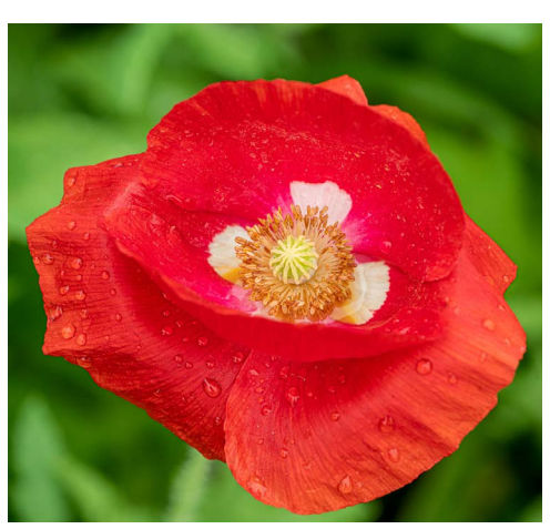
Finalist: Larry Peruffo