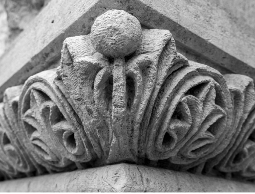
Finalist: Linda Youngblood