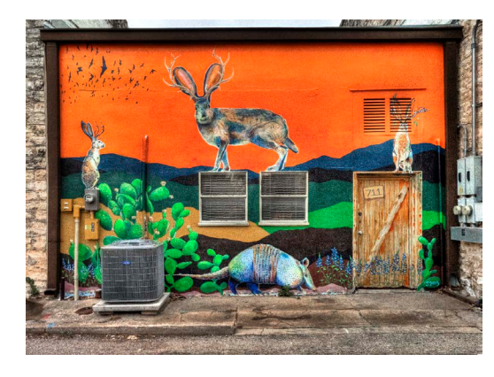
Finalist: Pete Holland