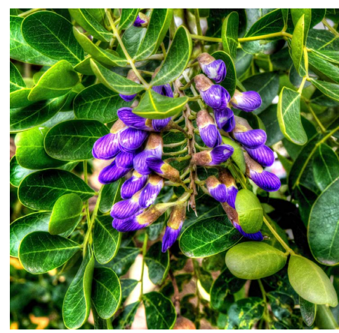
Finalist: Beverly Lyle