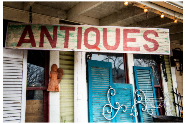
Finalist: Larry Peruffo