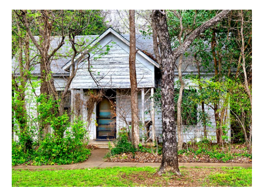
Finalist: Beverly Lyle