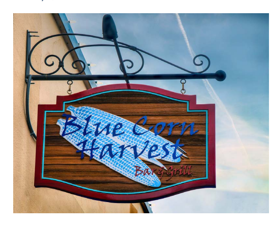
Finalist: Beverly Lyle