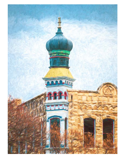
Finalist: Linda Youngblood