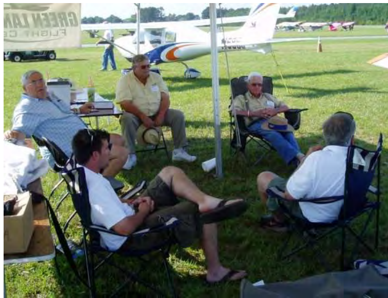
Here the gang discusses what they are all going to do with their anticipated stimulus packages.