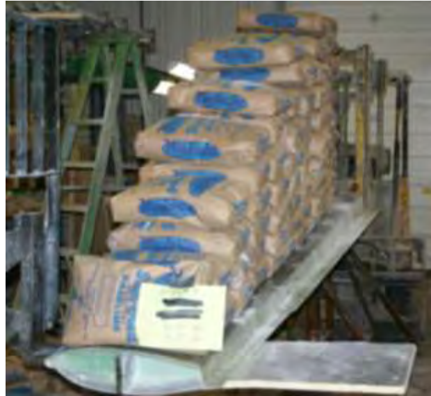
5,000lbs of Wisconsin Barn lime provides the load required.

The LS-1 does incorporate one additional change to the wing - a permanent 3 degree trailing edge droop. The flaps, ailerons, and wing tips all are drooped slightly. This gives a more cambered airfoil and induces some drag, helping to slow the aircraft down and slow the stall speed to well below 45 knots.