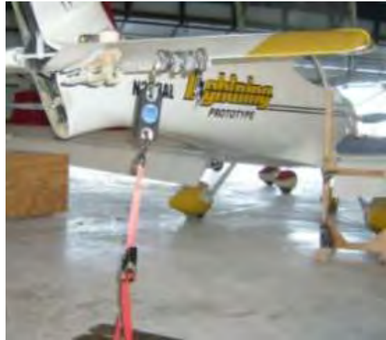
Hinge line testing on 233AL.

Note of interest: The prototype Lightning, N233AL, was used as a test bed for some of the structural testing. If a complete system was needed and building one would have been too costly in time and materials, we opted to use N233AL. This aircraft is a flyable aircraft and is flown on a regular basis. It also was used for all spin testing done on the Lightning design.