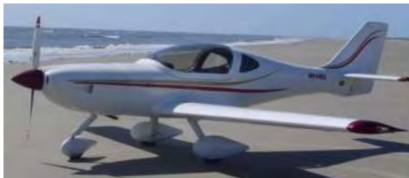
Above is still my favorite photo of N414GL. Surfs up.