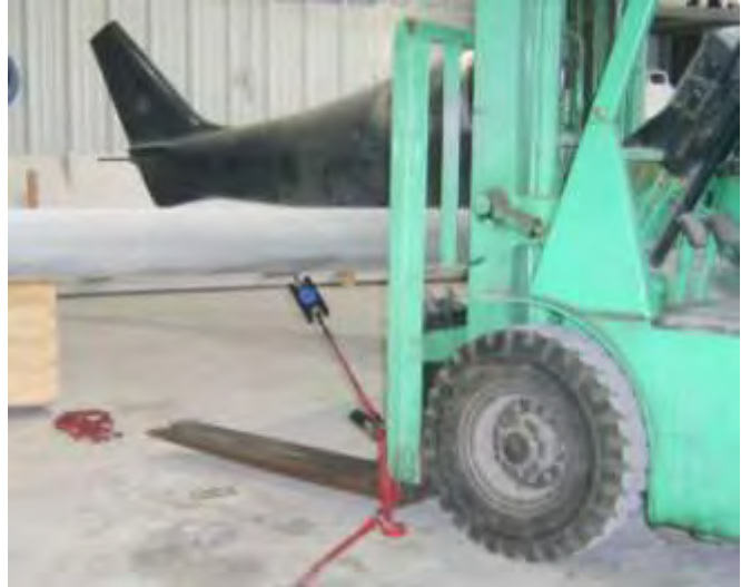
Out board tie down points, flap brackets, being tested.

The standard calls for them to hold the aircraft down in a 38 knot ground gust. The expected lift produced by the wing in a ground gust must be computed. Then that load distributed correctly for each tie down point. Next, pull on it and see if it holds. Using a ratchet strap with a digital scale inline, we applied well over the required load to 130 lbs with no problems; the fork lift was used for a hard point to pull from.