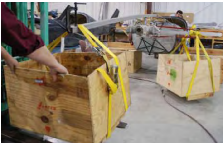
Positive limit load with max engine torque applied.

We used some left over engine boxes to hold the weight and a system of levers and straps to hold it all in place. That is Mark looking over the tail from a safe spot; sorry about the bar for building your Zenith, it went to better use!