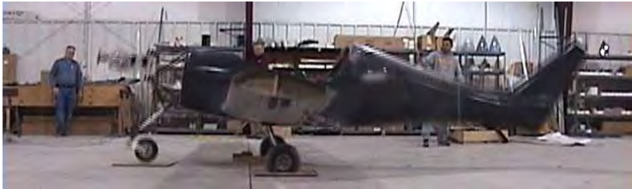
Drop test from 13" at 1320 lbs tail low main gear landing only.

After this testing was successfully complete, it was brought to our attention that these "controlled crashes" didn't need to be accomplish at gross, but rather at a weight lower than that. Taking into account the lift that wings provide during a full stall landing would have reduce the drop weight to near 900 lbs. Since the aircraft held at 1320, we opted not to test again or re-design, leaving the added safety factor in place.