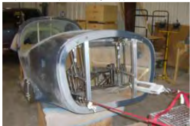
Rudder pedal force test.

During this test the upright rod deformed slightly as did the flute tube. Note, these did not fail or interfere with normal operations, but they must hold, so the upright design was changed and the tube wall thickness increased. These changes were incorporated and tested again; all held with no problem. This design change has now been incorporated into the kit to improve them as well.