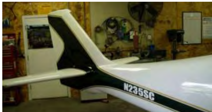
This Lightning is going to Spruce Creek Airpark, near Daytona Beach, FL. Runway there is 23 & 05. Check out its N number.