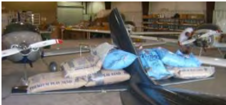
Horizontal tail plane loaded to 7.07G.

Tail - The horizontal tail and attach points, spars, and tail itself were tested for the balancing loads and gust loads expected on the horizontal tail in flight. Elevator hinge and rudder hinge lines were also tested. Some were conducted on test fuselages while the good ole' prototype Lightning was used for others.