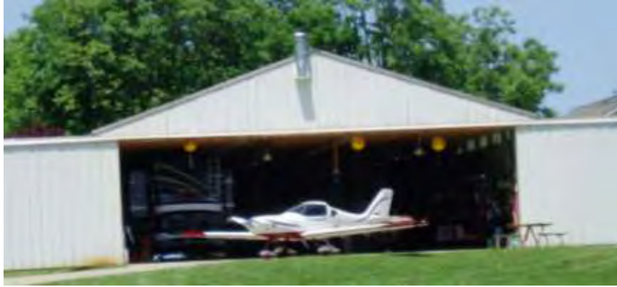
Buddy's hangar – impressive.