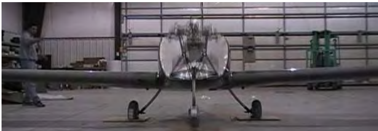
Same drop as above but forward view.