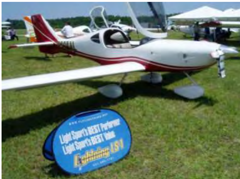
The LS-1 was one of the most beautiful aircraft on display and drew lots of interest from fly-in attendees.