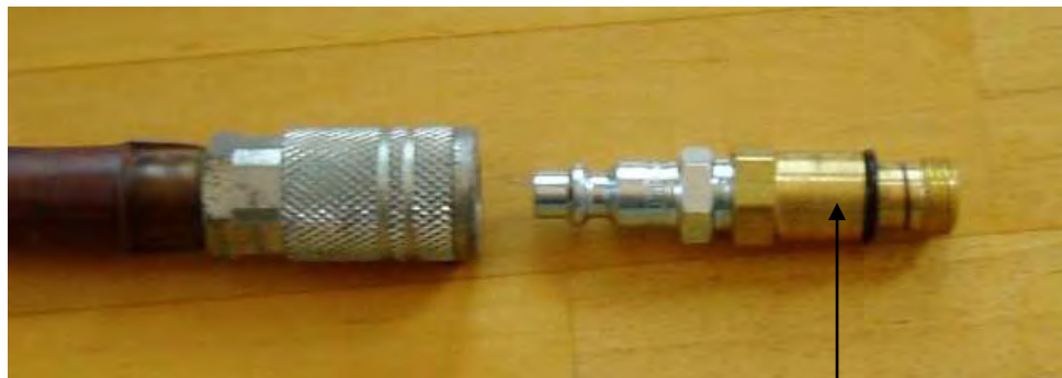
Spark plug hole adapter w/ 14MM threads

Compressions checks on a regular basis for your Jabiru engine is also a good way to monitor the health of your engine's cylinders and you can use the same compression tester that you used for your Lycoming or Continental. However , the adapter that screws into the spark plug hole for those US engines will not fit your Jabiru spark plug hole. You will need an adapter with the same threads as the NGK plugs that the Jabiru engine uses, and that requires one with 14 MM threads. I was able to order an adapter at a local auto parts store. Then all you have to do is add the quick release male coupler plug (1/4 " NPT) that fits your compression tester and you are in business. See the photo below.