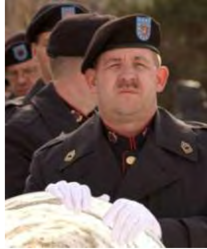
2005 Presidential Inaugural Parade

Andrews Air Force base when I was a young boy or from my first airplane ride at the age of 15 in a Beechcraft Sundowner. No one in my family had even tried to learn how to fly, though my father built a glider of his own design as a young boy in the early 30's and about killed himself trying to fly it off a very high wall. While stationed in Japan I hitched a ride in a C-172 at Yokota Air Base and it was there that I decided to start saving my money to learn how to fly. When I returned stateside I started taking lessons at Langley Air Force Base in Hampton, VA but quit in frustration after 20 hours. There is a lot to be said about working with an instructor that you can get along with.