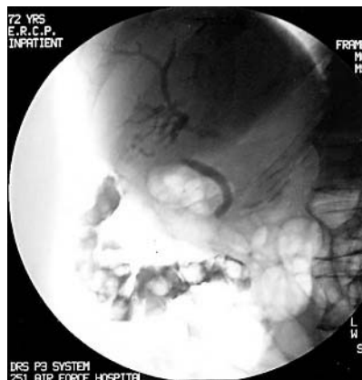
Figure 1 Visualisation of the colon shortly after cannulation of the common bile duct and contrast medium injection during ERCP.

C holecystocolic fistulas comprise between 10% and 20% of all biliary intestinal fistulas. In the majority of cases they are a sequel of cholecystitis but are reported to complicate only 0.13% of cases. 1