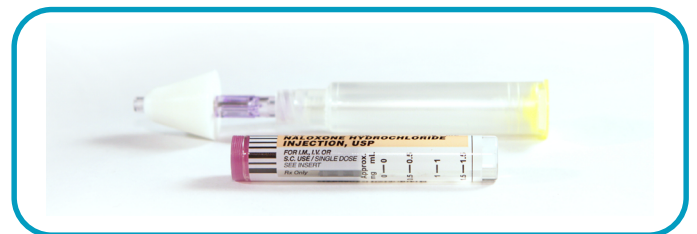
Figure 1. Intranasal kit Used with permission. San Francisco Department of Public Health. Naloxone for opioid safety: a provider's guide to prescribing naloxone to patients who use opioids. January 2015.

IN kits should contain: 2 naloxone 2 mg/2 ml prefilled syringes, 2 atomizers, step-by-step instructions for responding to an opioid overdose, and directions for naloxone administration.