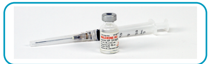
Figure 2. Intramuscular kit Used with permission. San Francisco Department of Public Health. Naloxone for opioid safety: a provider's guide to prescribing naloxone to patients who use opioids. January 2015.

IM kits should contain: 2 naloxone 0.4 mg/ml vials, 2 IM syringes, step-by-step instructions for responding to an opioid overdose, and directions for naloxone administration.