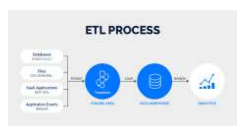
Figure 1: ETL Process

It has been well established for many years that ETL is a technique and that its functions are not confined to data warehouse environments: any enterprise's information technology backbone is comprised of a diverse range of proprietary applications and database systems. For applications or systems to integrate and offer at least two apps with the same perspective of the world, data must be shared between them across all of their components. Much of this data sharing was managed through methods that are now commonly known as ETL (enterprise transactional library). ETL expenses are always the easier side of the equation to estimate because they are based on tools and time [7]. Saving money on ETL requires choosing a solution that is simple to use, connects well with your existing data architecture, runs rapidly, and can expand when you add more data or change your models, among other characteristics as mentioned in Fig.1.