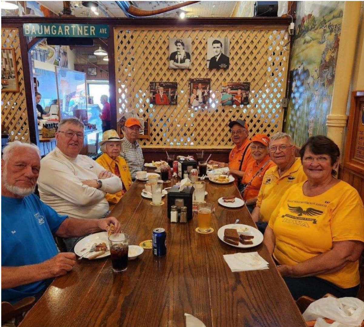
Baumgartners in Monroe, WI