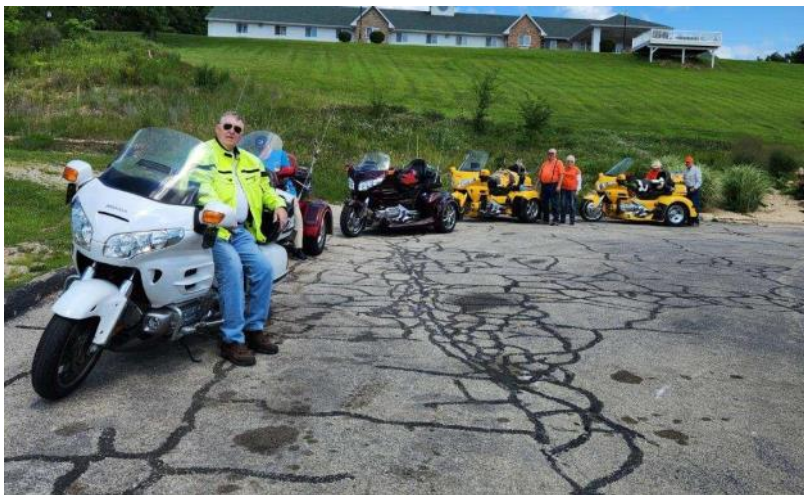
Stop in Savanna