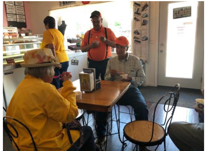
Ice Cream stop at Three Sisters in Elizabeth