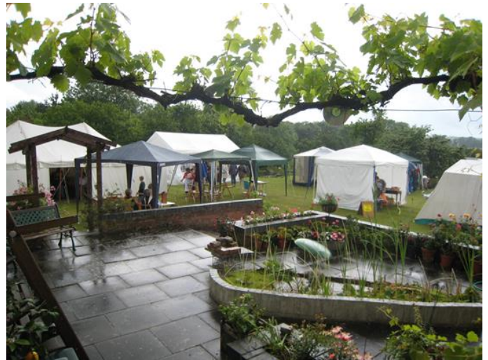
The tents – a wet fete!