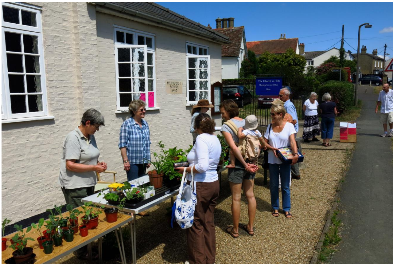
Plant stall, Methodist Chapel