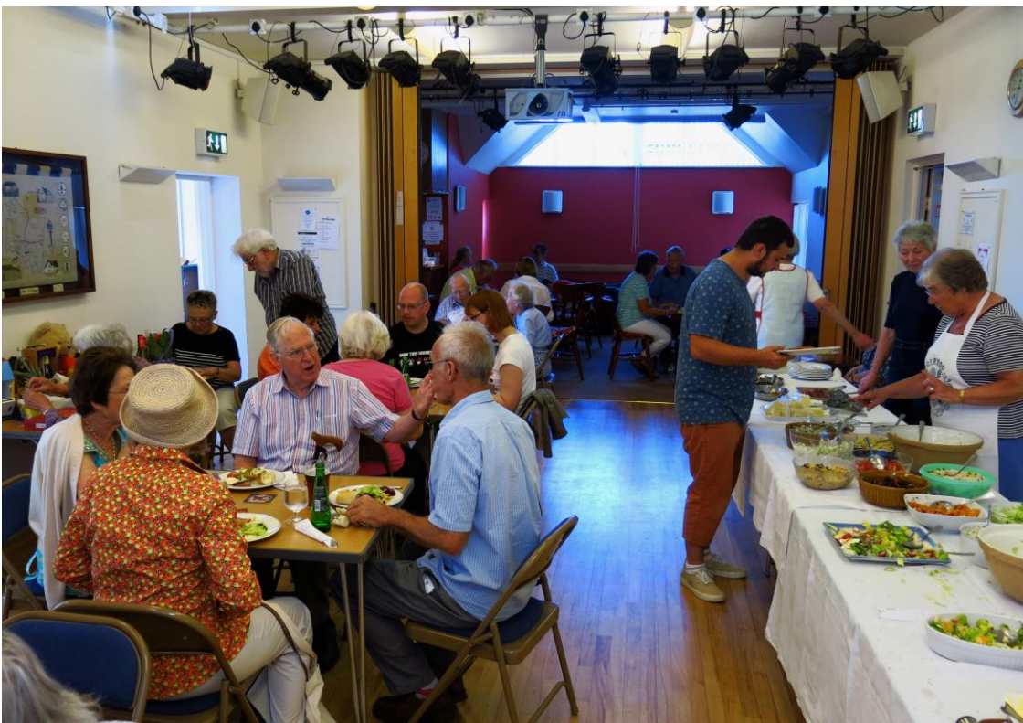
Fine fayre at Toft People’s Hall