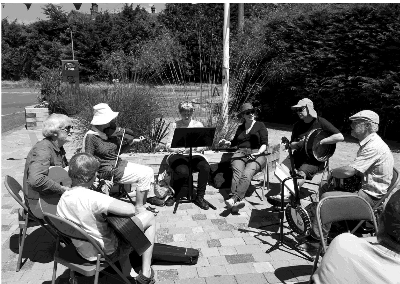
Toft Session Senior & Junior entertain the lunchtime crowds, People's Hall