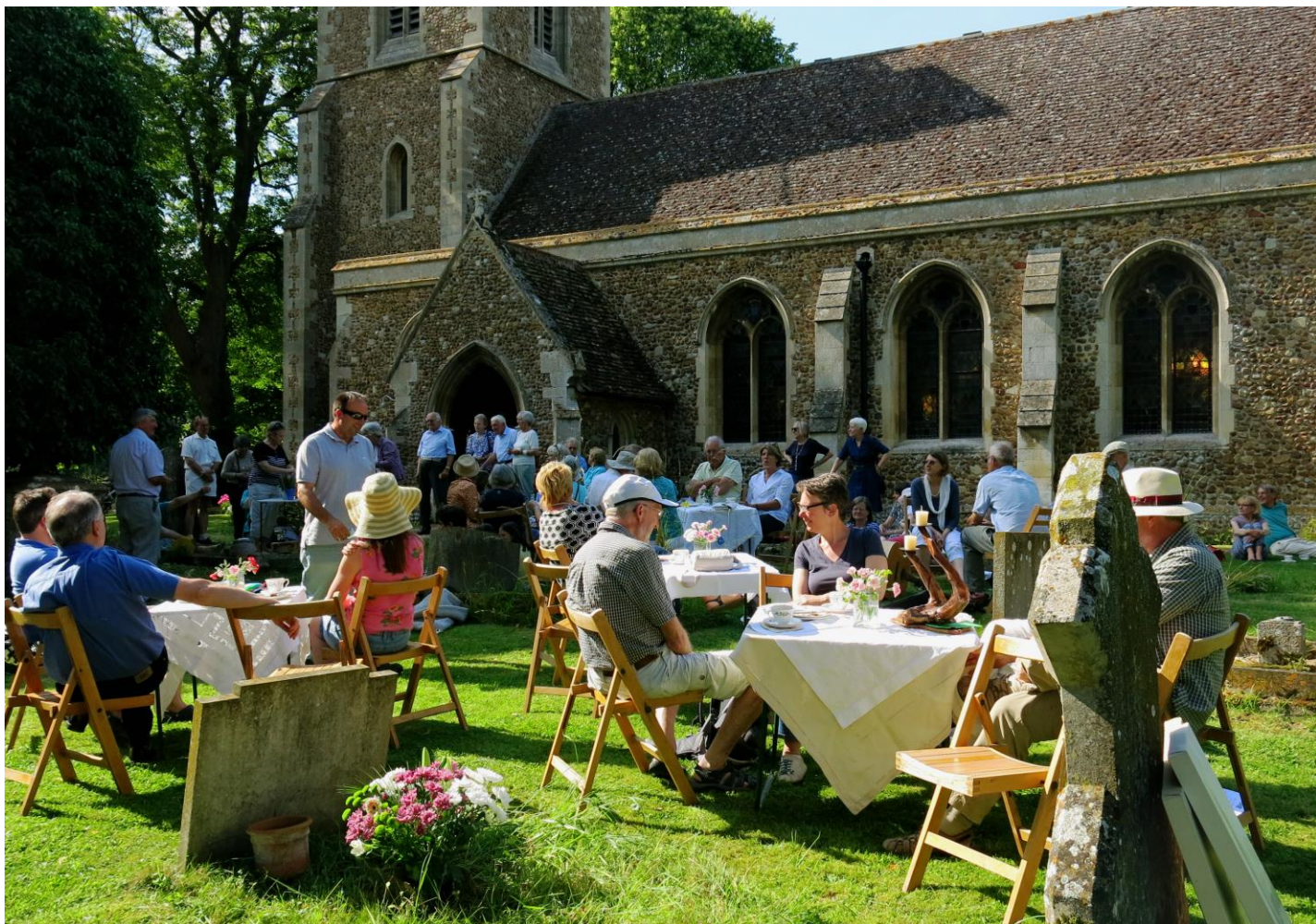
Tea-time in Saint Andrew's churchyard