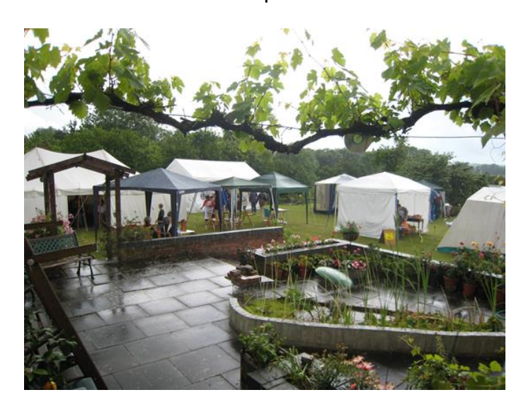
The tents – a wet fete!