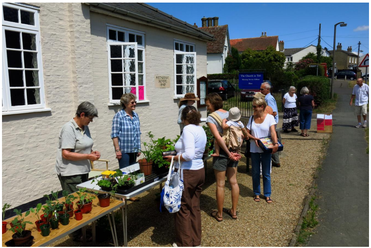
Plant stall, Methodist Chapel