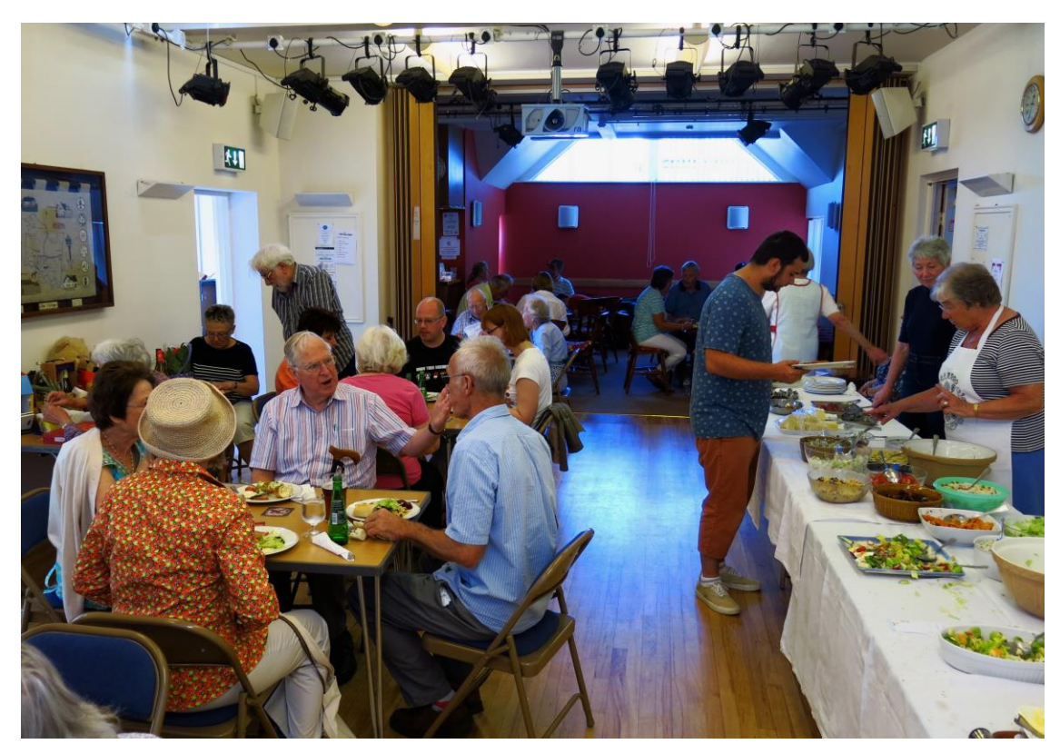
Fine fayre at Toft People's Hall