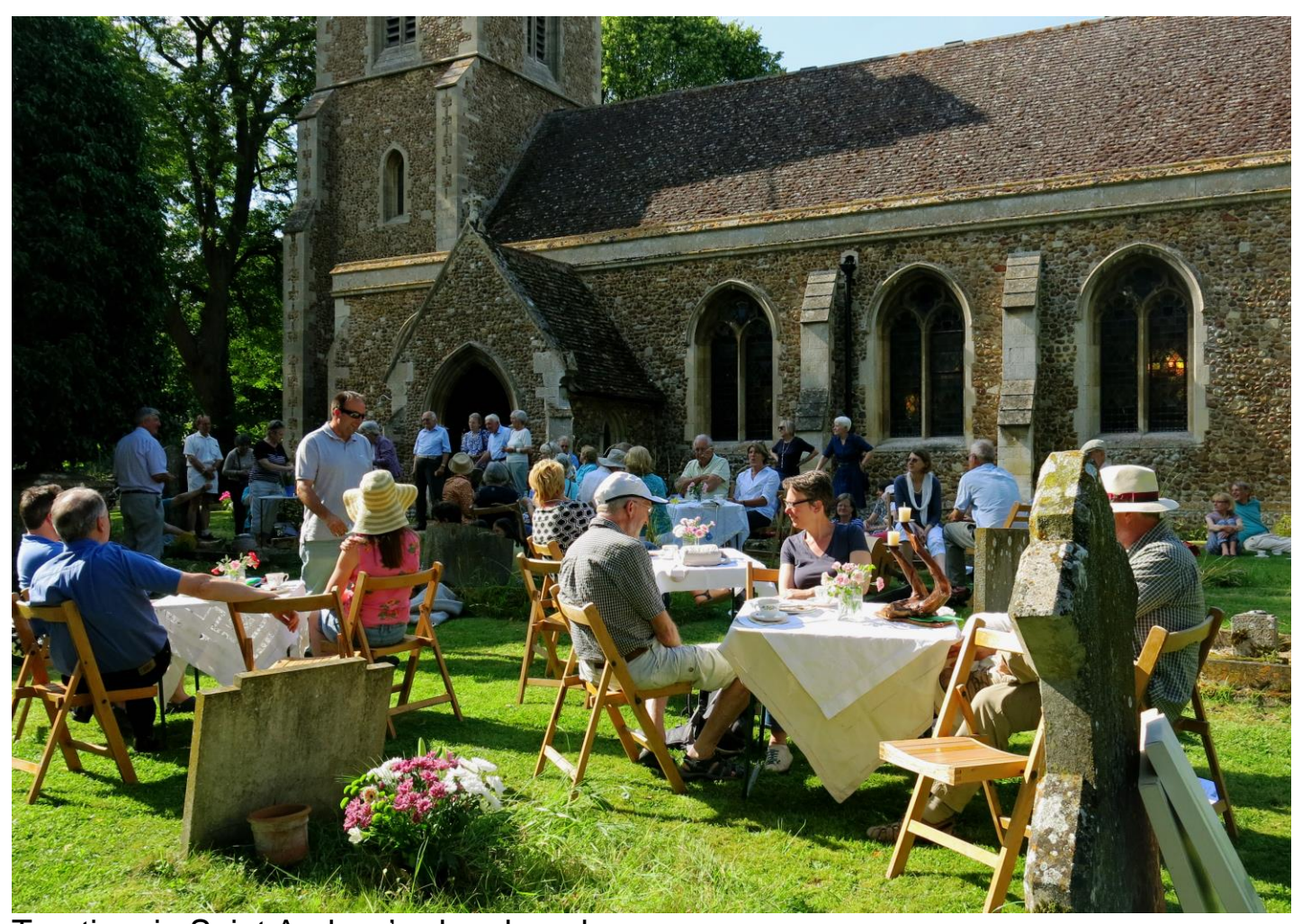
Tea-time in Saint Andrew's churchyard