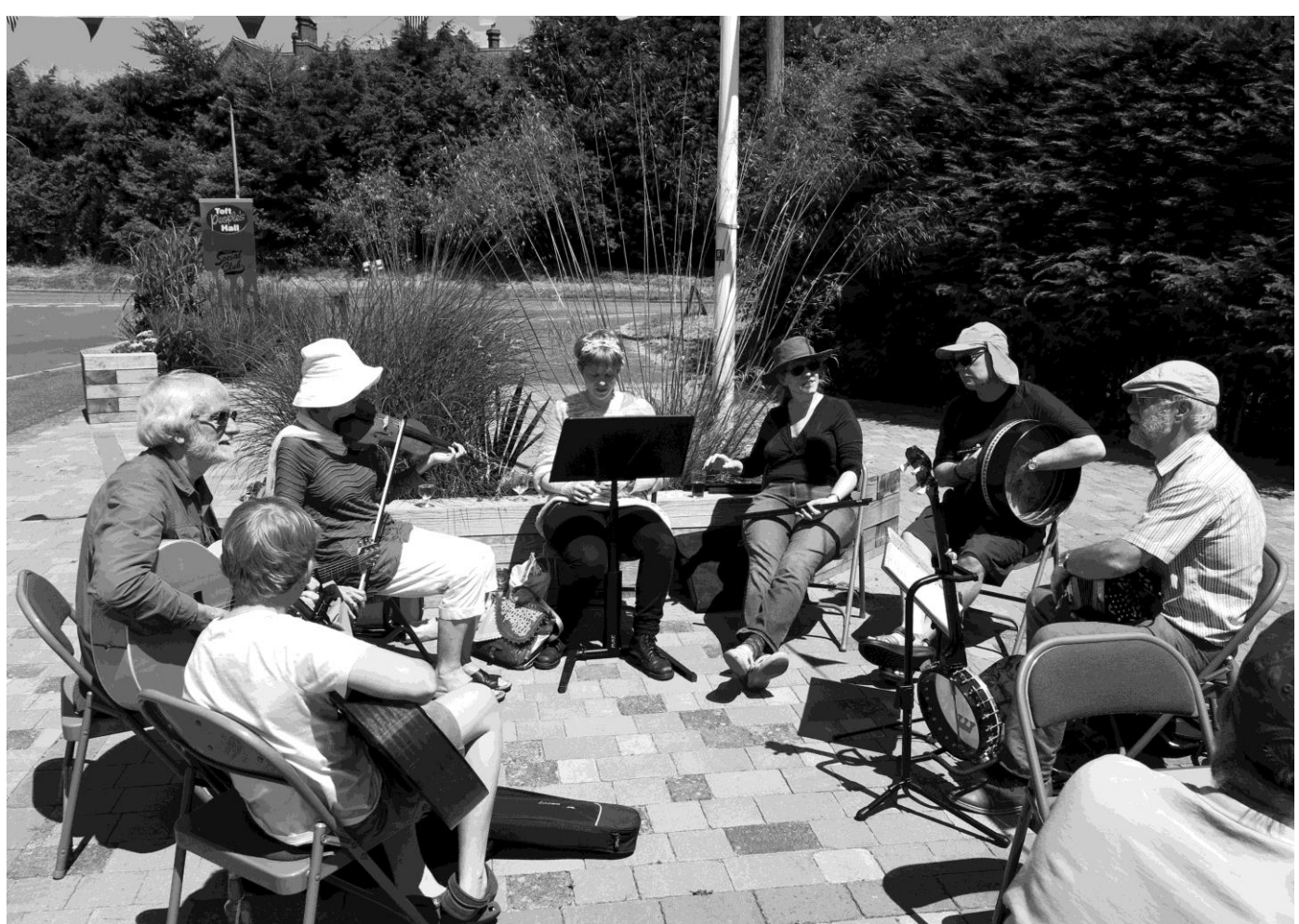
Toft Session Senior & Junior entertain the lunchtime crowds, People's Hall