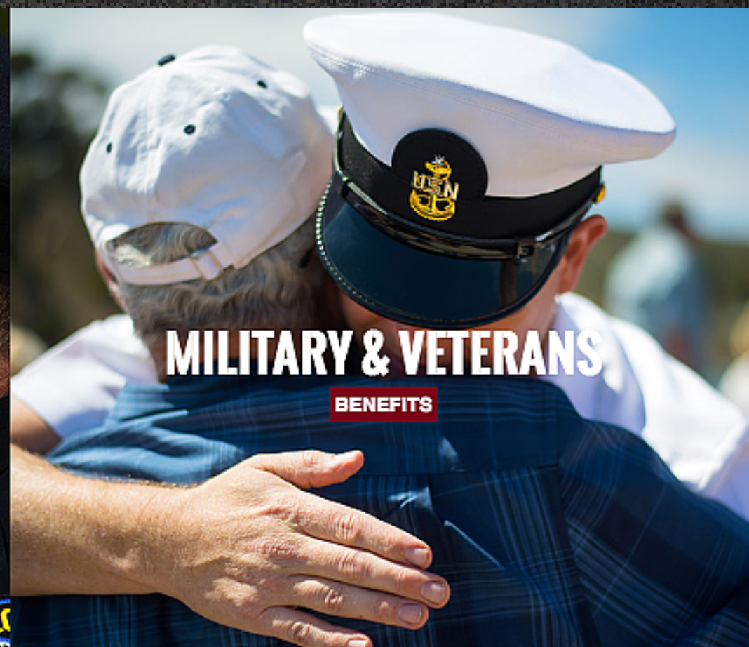
MILITARY & VETERANS BENEFITS