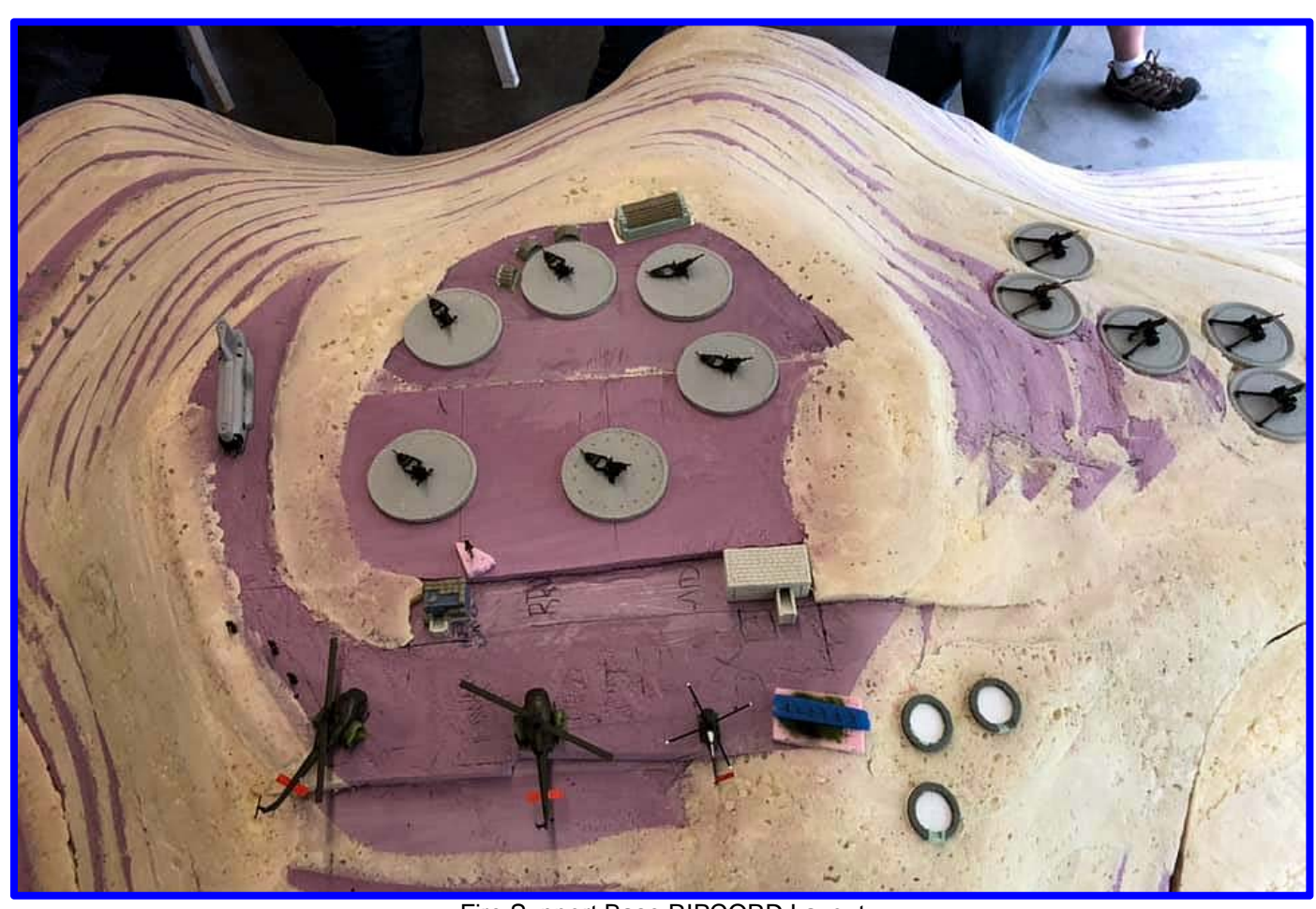
Fire Support Base RIPCORD Layout