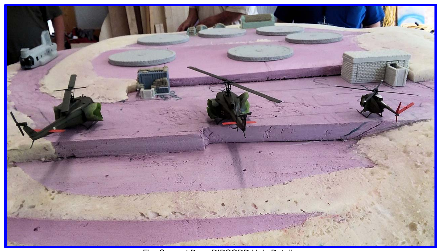
Fire Support Base RIPCORD Helo Details