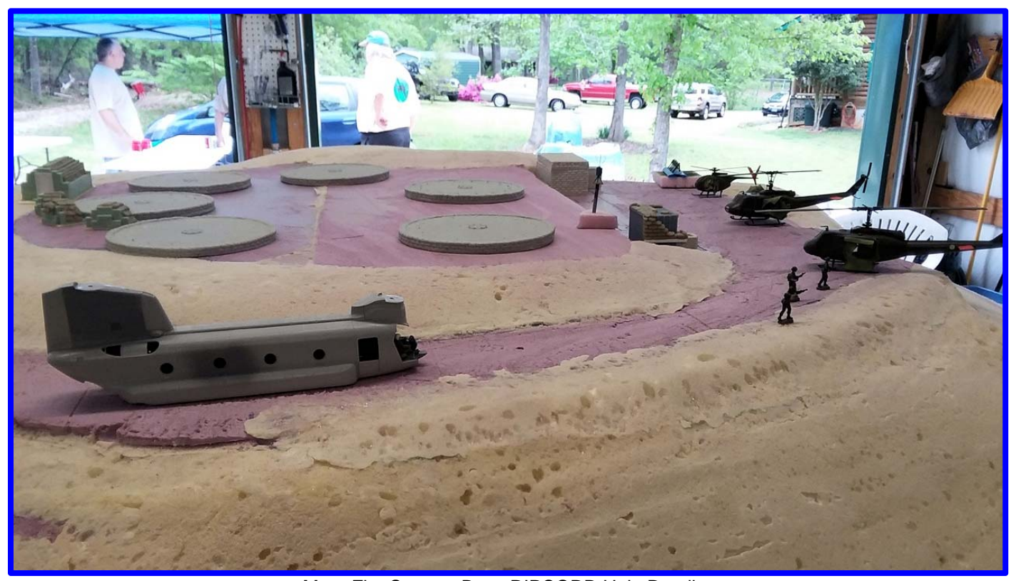
More Fire Support Base RIPCORD Helo Details