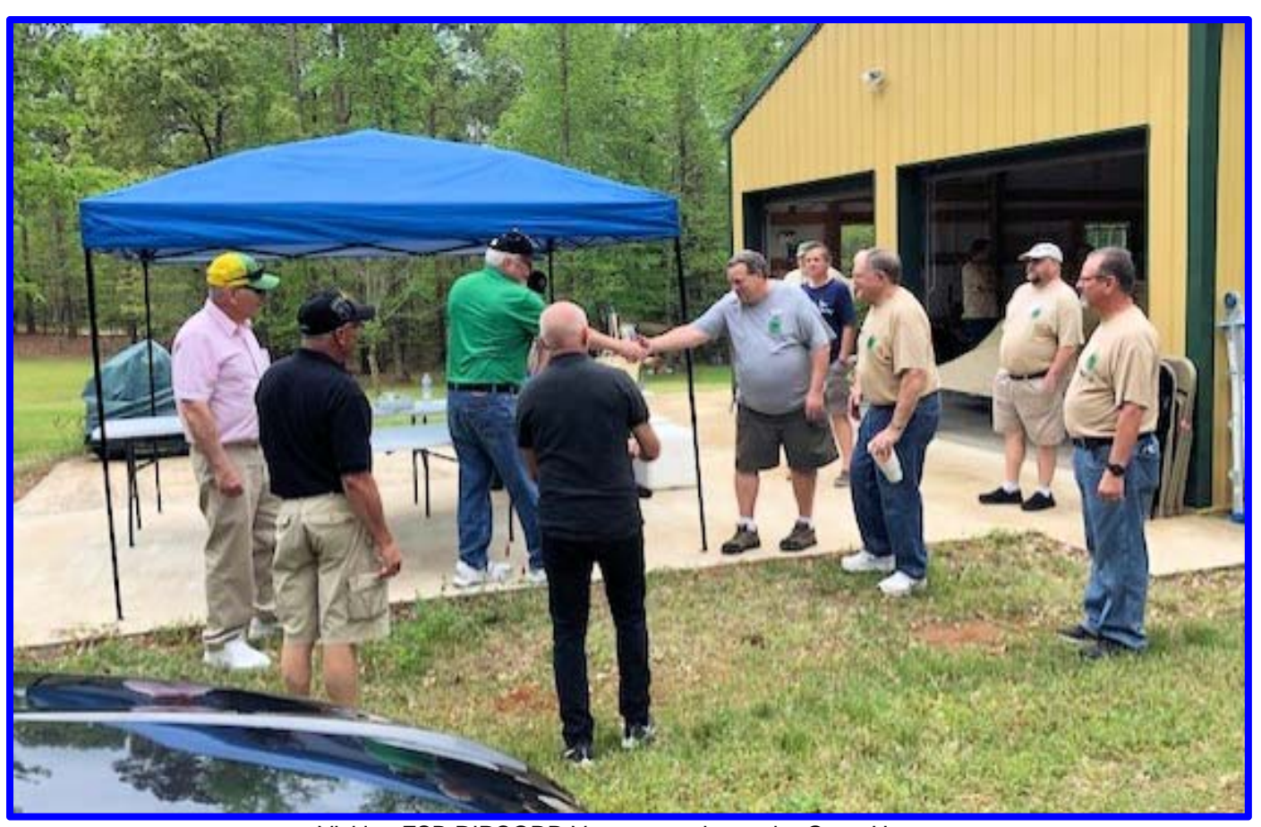
Visiting FSB RIPCORD Veterans arrive at the Open House