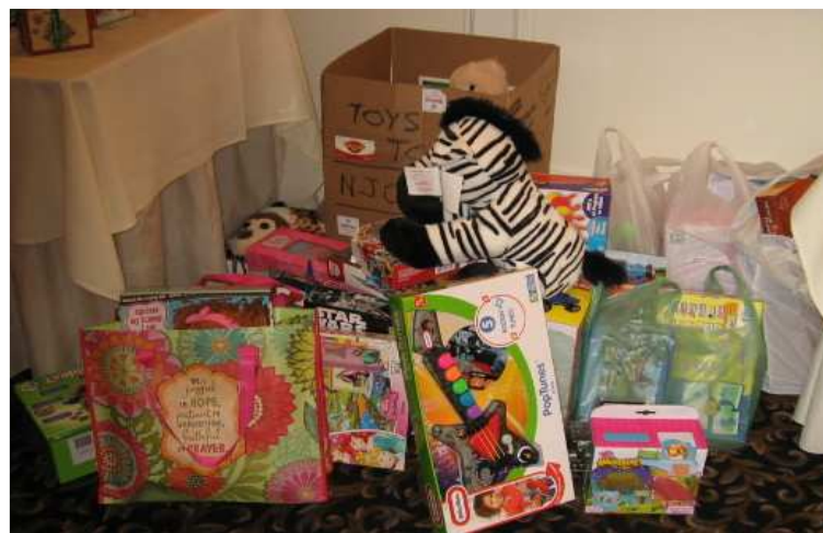
Toys for Tots