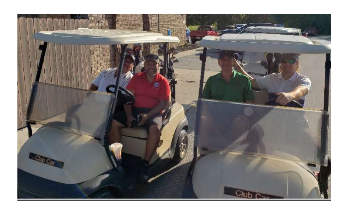
33 Golfers completed the course at Leaning Tree in Wales Township.