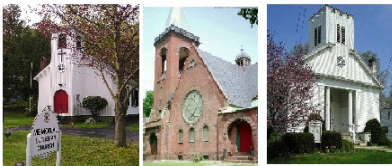
LUTHERAN PARISH OF NORTHERN DUTCHESS