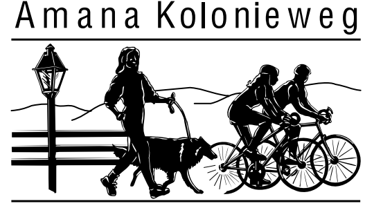
Amana Colonies Recreational Trail