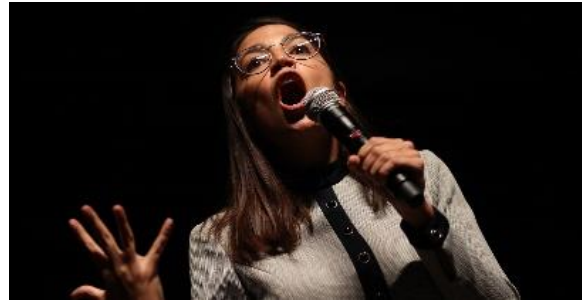
AOC announcing her cancellation schedule

A few months ago, the fledgling “cancel culture” was busy removing statues, portraits, and historical accounts of our Founders and other prominent historical characters. This ranged from Christopher Columbus and George Washington to former slave and civil rights leader Frederick Douglass. It seemed that no logical reason was necessary, other than emotional expression of personal opposition or hatred.