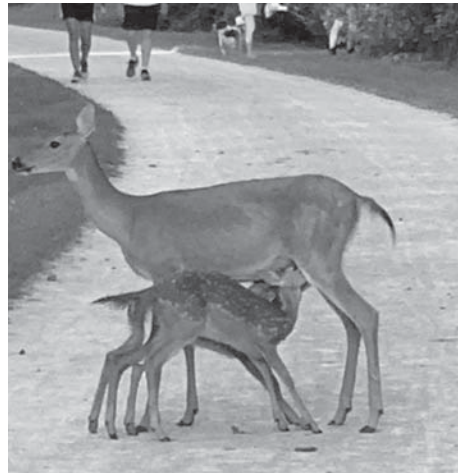
Some nature on the Montour Trail.