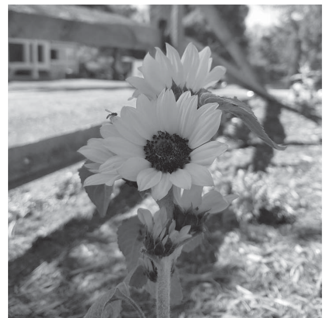
Eye catching sunflowers at Pittsburgh Botanic Garden.