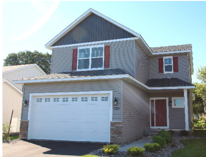
*SOME OPTIONS MAY BE SHOWN*