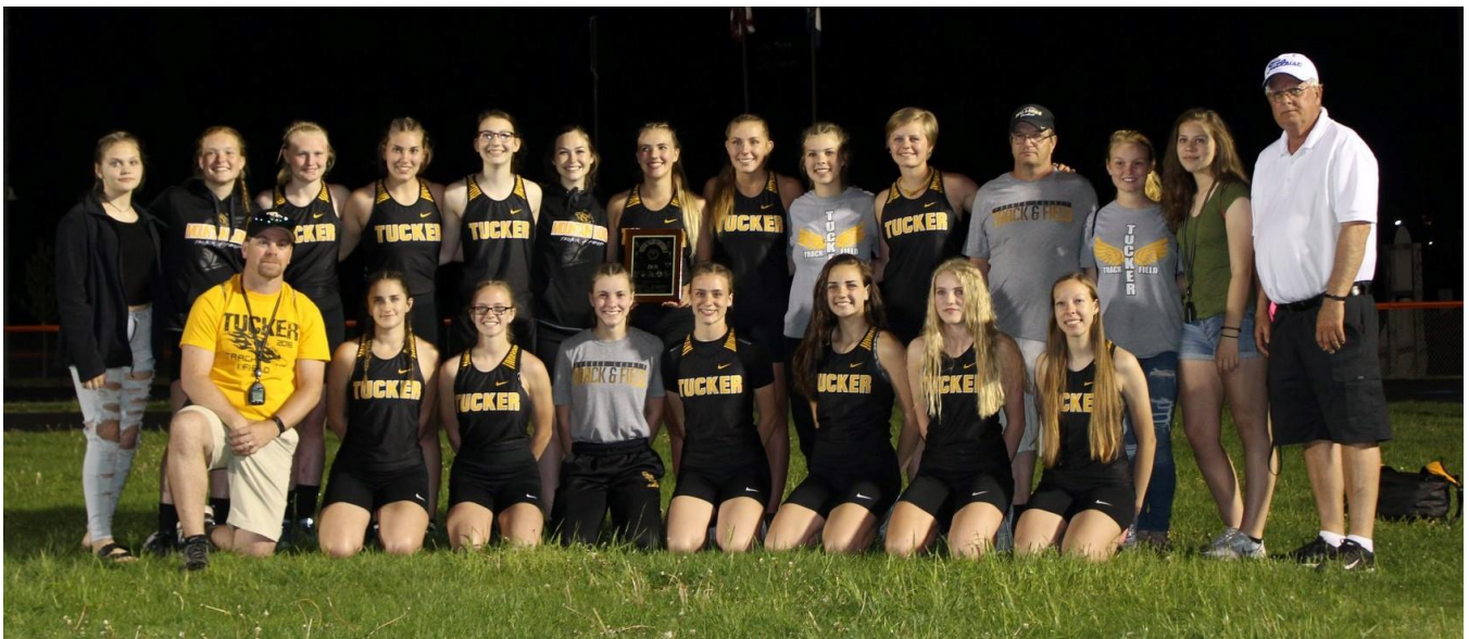
Tucker County Girls' Track team after capturing the PVC Championship on May 1st in Elkins.