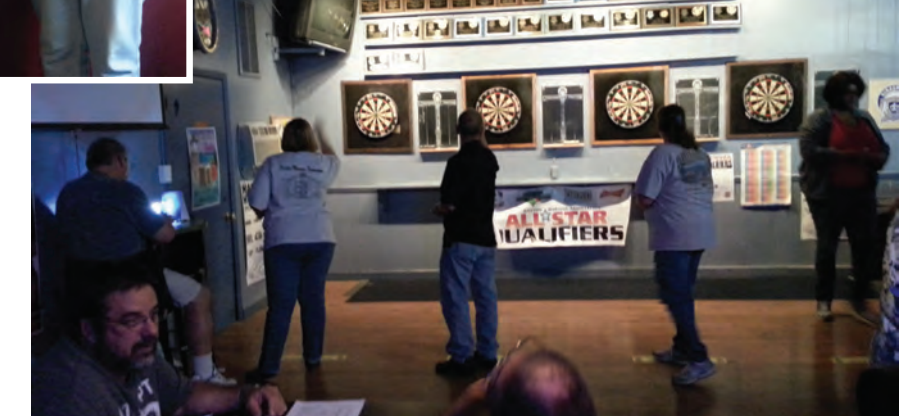
Make Sure You Take Your Best Shot in 2014!

(below) A typical qualifer at King's Point Pub. DDA board members volunteer their time to take scores and run the events.