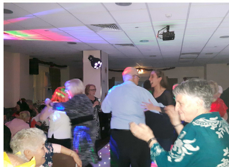
BRIARS HALL VISIT & MEAL