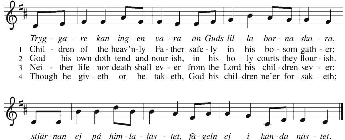
stjär-nan ej på him - la - fäs - tet, få - geln ej i kän - da näs - tet.nest - ling bird nor star in heav - en such a ref - uge e'er was giv - en. From all e - vil things he spares them, in his might - y arms he bears them. un - to them his grace he show - eth, and their sor - rows all he know - eth. his the lov - ing pur-pose sole - ly to pre-serve them pure and ho - ly.