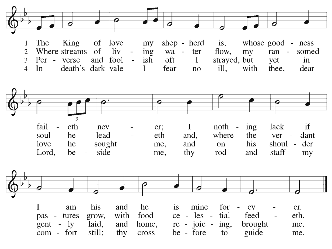
PSALM: The King of Love My Shepherd Is (ELW 502)

5 Thou spreadst a table in my sight; thine unction grace bestoweth; and, oh, what transport of delight from thy pure chalice floweth!