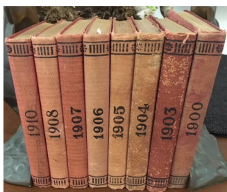
A sampling of the 63 years of journals kept by Hovey.