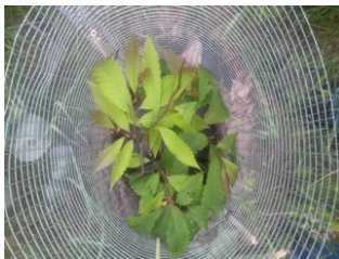
June 2, 2017