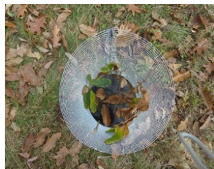
November 5, 2016