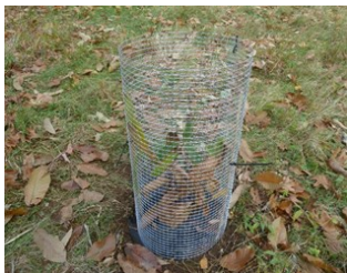
Protective Wire Cages

Below is a chronological view of the BMFA American Chestnut Seedlings over the past 18 months.