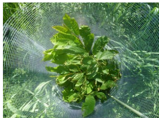
May 29, 2018