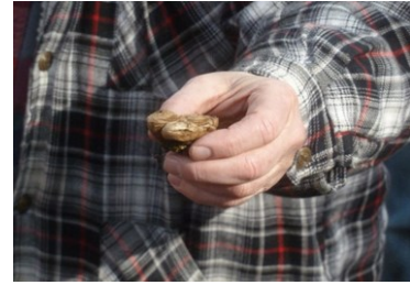
Image of a puff ball that releases spores when squeezed.

their way to the surface gradually through the freezing and thawing of the soil.