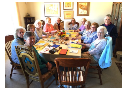
Huachuca Area RW Board Meeting.