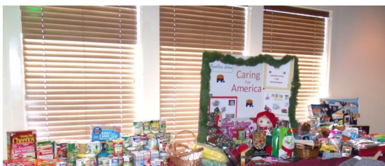
Huachuca Area RW: Caring for America donations.