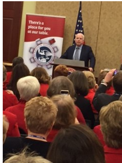
Several members of Lincoln RW and Paradise RW attended the March NFRW Day at the Legislature in Washington DC. Seen here is Arizona Senator John McCain speaking to the ladies in attendance.