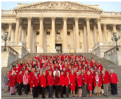
Ladies from Republican Federation clubs all over the country attended the event.