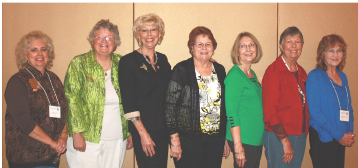
Huachuca Area RW members at the Winter Meeting in Tucson.