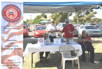
Central RW of Phoenix hosted a table at South Mountain LD27 Patriots in the Park event.