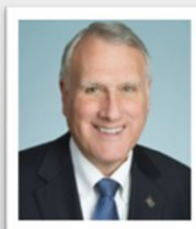
Senator John Kyl