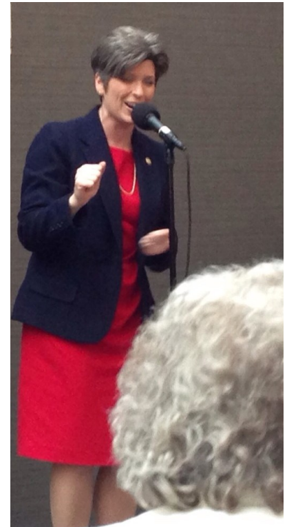
One of the many esteemed Republican's who spoke at the Day at the Legislature: Senator Joni Ernst from Iowa.