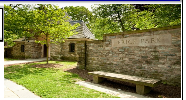
Figure 1 Frick Park is the largest municipal park in Pittsburgh, Pennsylvania, covering 644 acres. It is one of Pittsburgh's four historic large parks and one I often visited as a young qirl.

Parents living in relatively safe apartment buildings arrange, for the children who live in their building, to play in the hallways. Children bring their toys into the corridors and play school, house, and even church. Tiny children pedal their plastic tricycles and cars up and down the halls. Parents keep their doors ajar to keep a watchful eye on the children and to allow the children to run into the house to get water and use the bathroom. Typically, one or two parents provide treats for all the kids playing in the hallway. For the kids living in standalone houses with porches or yards, and swimming pools, their parents often coordinate similar activities.