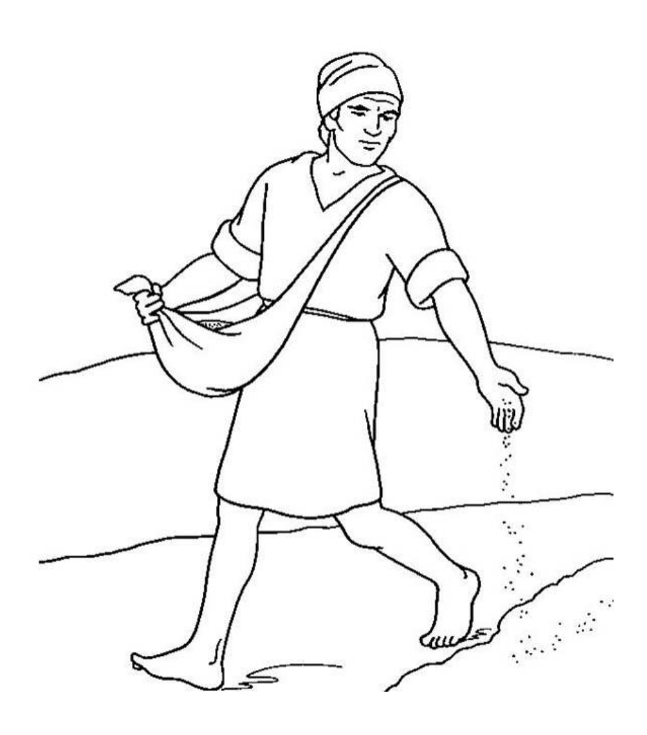
The Parable of the Seed Mark 4:26-29

Color the picture of the worker planting the seed.