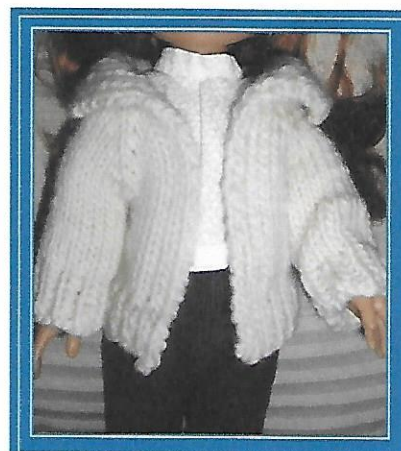
Sweater above has a K,P,K,P along front edges.

For more information, visit Stitchin' for Kids website at stitchinforkids.org .