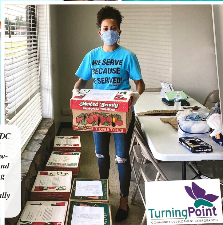
Turning Point CDC will provide food distribution to low-income seniors and families including access to fresh produce and locally sourced protein