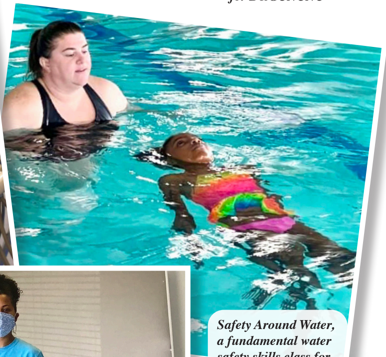
Safety Around Water, a fundamental water safety skills class for all 2nd grade students is offered by the YMCA in conjunction with Vance County Schools.