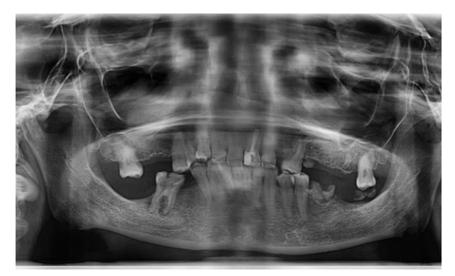
Figure 3. Panorex radiograph reveals abscesses associated with carious teeth, retained roots and generalized bone loss.

patient had generalised mild to moderate bone loss indicative of mild to moderate generalised periodontal disease. Failed restorations, plague and calculus was visibly present indicative of poor oral health status and poor oral hygiene (Figure 4). The upper left third molar (28) was found to be vital and had no lesion or periodontal involvement. The patient reported that as the lesion expanded she experienced pain whenever she bit or chewed hard and the lower retained roots pierced the lesion or when she ate something that caused irritation to the lesion. A full blood count was done and the results were found to be within normal limits.