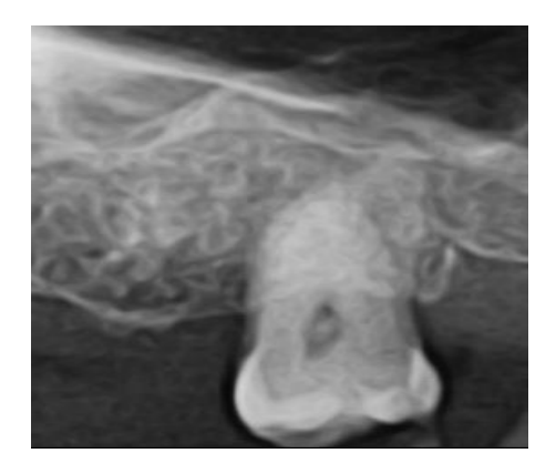
Figure 7. Peri-apical radiograph revealed no pathological findings

Accurate classification of a PGCG depends on the radiological finding particularly if there is no bone involvement nor displacement of teeth. If the radiological findings indicate bone involvement, the differential diagnosis would include brown's tumour (hyperparathyroidism) and giant cell tumours of bone. In some superficial erosion of the instances interdental bone crest or of the alveolar bone margin in edentulous areas is noticeable.<sup>1</sup> No radiographic changes was observed except for the generalised bone loss indicative of generalised periodontitis which further asserted the diagnosis of PGCG (Figure 7).