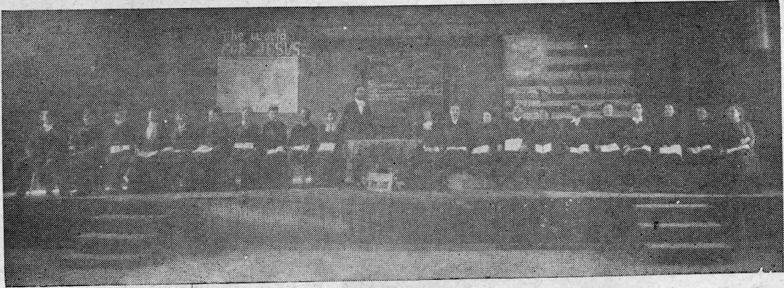
Students and Gospel workers of the noted Bryan Hall Revival Meeting that swept the City of Houston, Texas, in 1905. The late Charles F. Parham standing.