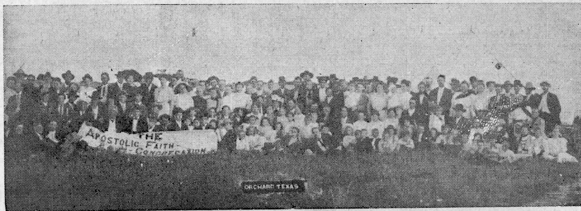
The great Tent Revival of Orchard, Texas, where the Baptism of the Holy Ghost first fell in Texas.

victory, he was pacing back and forth near the men. He sat down and with his face to the ground, he cried aloud to God for pardon. All the men came to him and on Section 13 of the Santa Fe Railroad they spent over an hour praying the Boss through;—the best hour's work of their lives—and he came through one of the brightest converts in all our meetings. Glory to God for one set of section men who were really all converted.