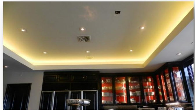
Cove accent lighting application

For residential and commercial applications.