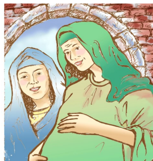
When Elizabeth heard the greeting of Mary, the baby leaped in her womb. Luke 1:41, ESV

How often have we been convinced to believe in a product’s worth because a “famous” person endorsed it – even when they have no related qualifications? Haven’t we all, at some point, judged people’s abilities, trustworthiness or integrity based on their age, physical appearance, skin-tone or economic success? Only God would have chosen a teenaged “nobody” or an elderly woman with a mute husband to be the instruments through which God’s greatest gift to humanity was delivered!