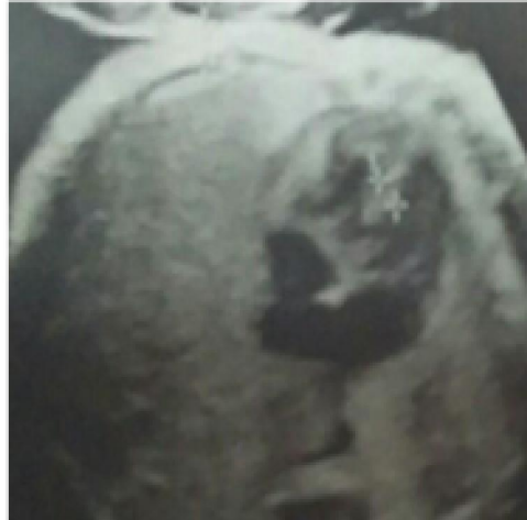
Figure (3): Measurement of the interventricular septum thickness.

A four-chamber view is obtained; the septum is positioned horizontally (in order to use the axial plane for measurement). The midpoint of IVS (halfway between the apex and the mitral valve) is selected and cine-loop is used to obtain the image of maximum ventricular filling (The smallest measurement). The image is optimized by using adequate magnification (heart approximately half of screen) and low dynamic range (compression) ( Patchakapat et al., 2006 ).