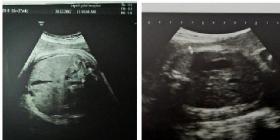
Figure (2): Measurement of AAWT.