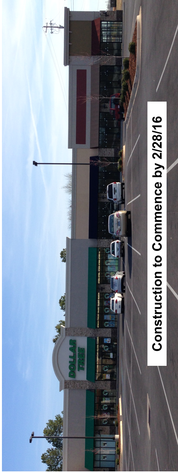
Construction to Commence by 2/28/16