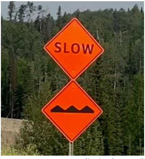
(Continued on page 4)

There were several different types of roads we encountered: Smooth paved asphalt, asphalt rough gravel mix, soft asphalt over dirt, soft dirt that when wet was like riding on ice, hard packed dirt, rough gravel dirt mix, and loose large gravel which was very dusty. (It was like riding in a London fog. We could no longer see the road in front of us or anything else for that matter until the dust settled.) We got to hate seeing "orange signs".