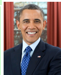
Barack Obama 2008-2016