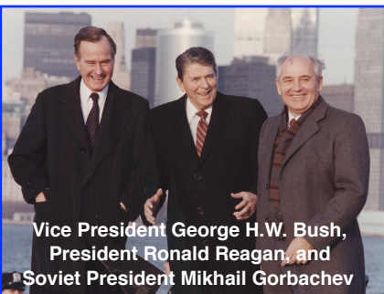
Vice President George H.W. Bush, President Ronald Reagan, and Soviet President Mikhail Gorbachev

SDI - STRATEGIC DEFENSE INITIATIVE "STAR WARS" - Reagan's plan to build a high-tech system of lasers and particle beams to shoot down Soviet missiles before they could reach the United States.