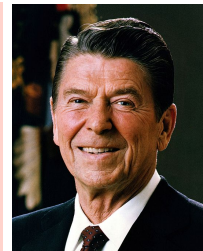
Ronald Reagan 1980-1988

Legislation passed in March of 2010, nicknamed " Obamacare ", required all Americans to purchase health care insurance and required states to establish exchanges individuals could purchase coverage at reasonable rates. The law also provided subsidies for poor and low income Americans to purchase insurance.