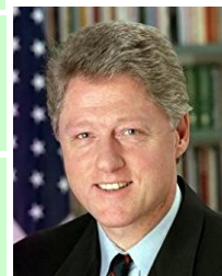
Bill Clinton 1992-2000